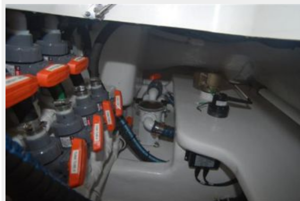
Viking 55 Convertible - Pump controls