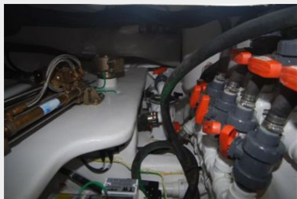
Viking 55 Convertible - Pump Controls