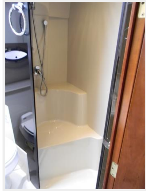
Separate Shower Stall