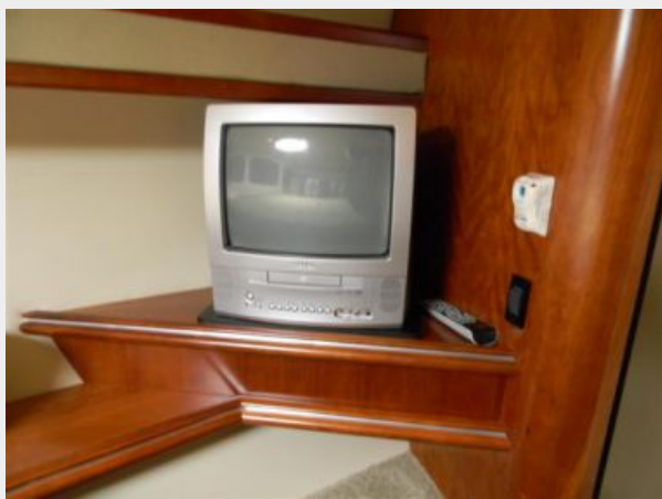
Master Stateroom TV/DVD