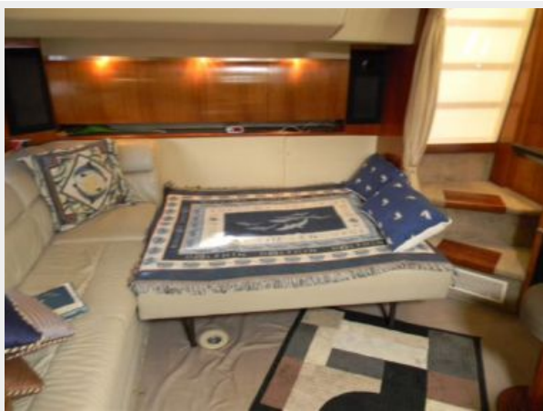
Salon Sleeper Sofa