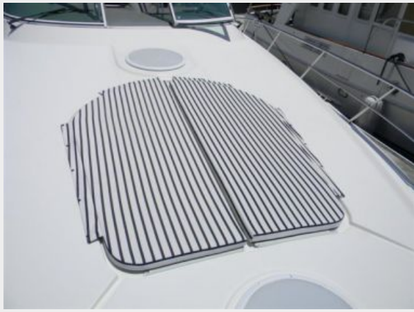
Custom Foredeck Sunpad