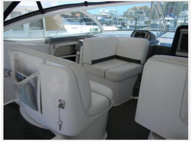
Companion Seat - Rotated