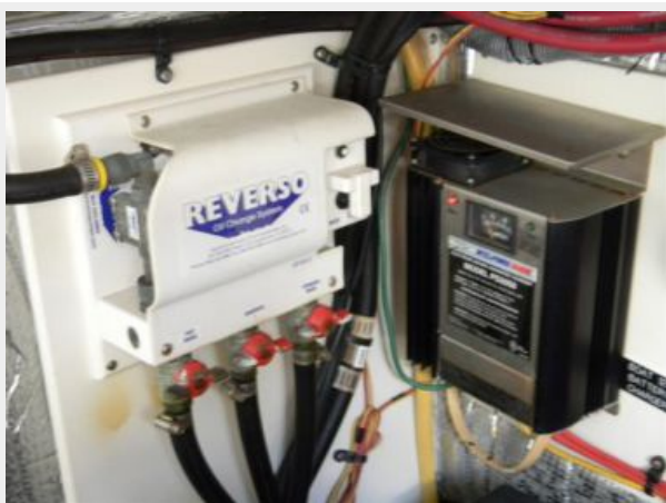
Oil Exchanger System