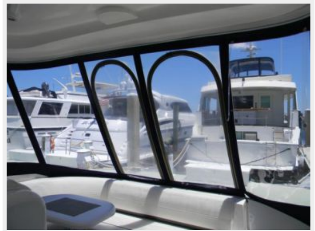
Aft Cockpit Enclosure