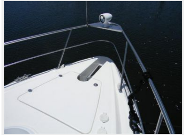
Covered Windlass Area