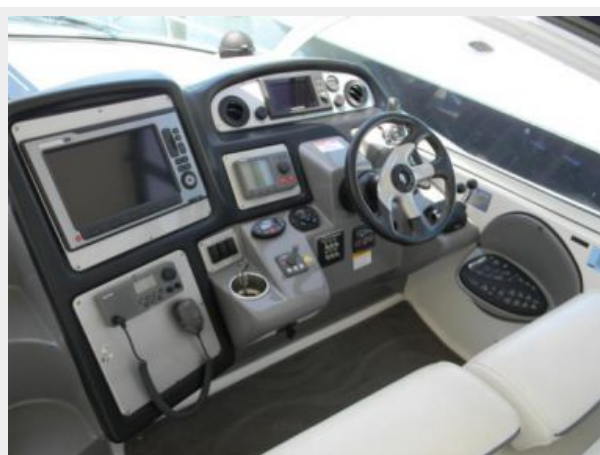
Helm and Electronics