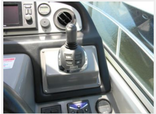
Joystick for Docking