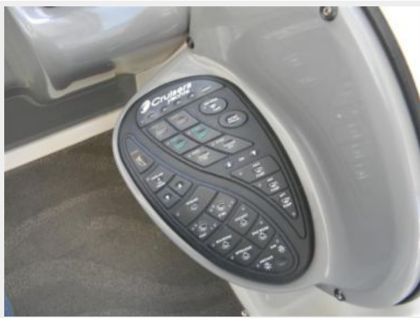
Helm Control Pad - Keyless Ignition