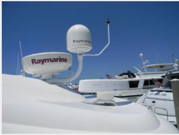
SAT TV/Radar / DGPS