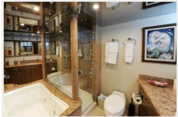
His & Her Master Bath