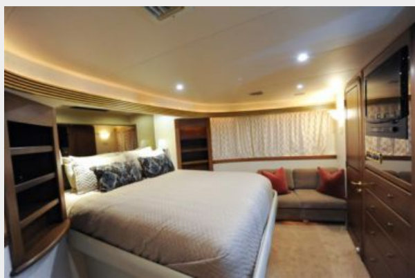
VIP Guest Stateroom