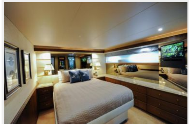
VIP Stateroom, Forward