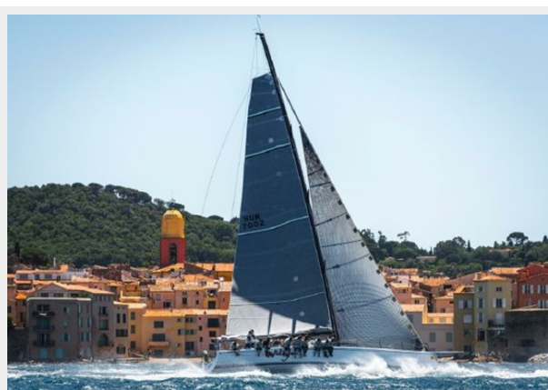
Wild Joe Sailing