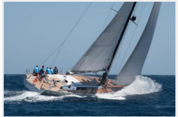
fn colombo ycpr 2016-056.jpg