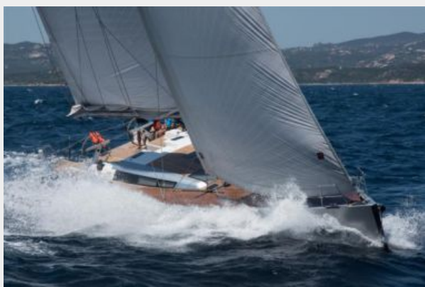
fn colombo ycpr 2016-075.jpg