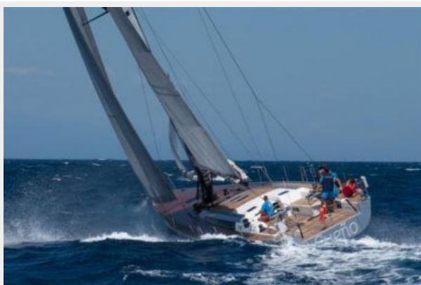
fn colombo ycpr 2016-087.jpg