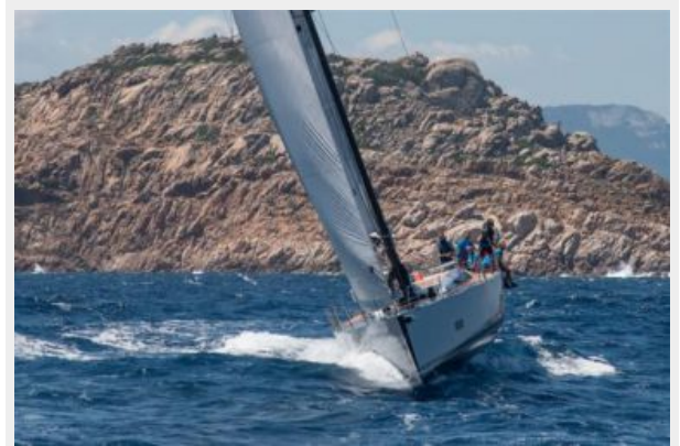
fn colombo ycpr 2016-081.jpg