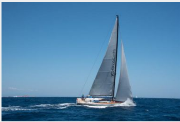
fn colombo ycpr 2016-059.jpg