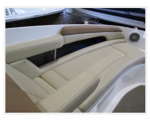
Bow seating 2