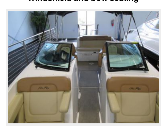
Windshield and bow seating