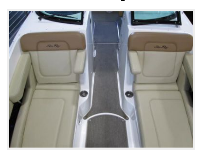
Bow seating 3