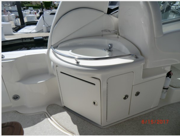
Cockpit Wet Bar