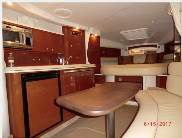
Cabin looking FWD