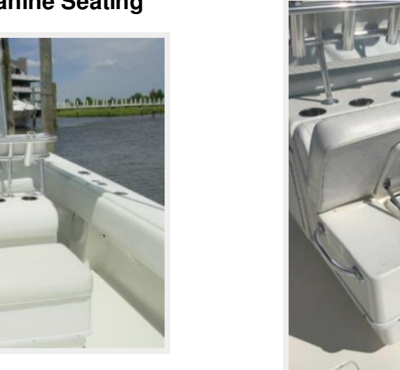
Leaning Post & Mezzanine Seating