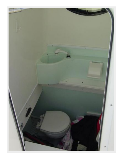
Center Console 1 - Head