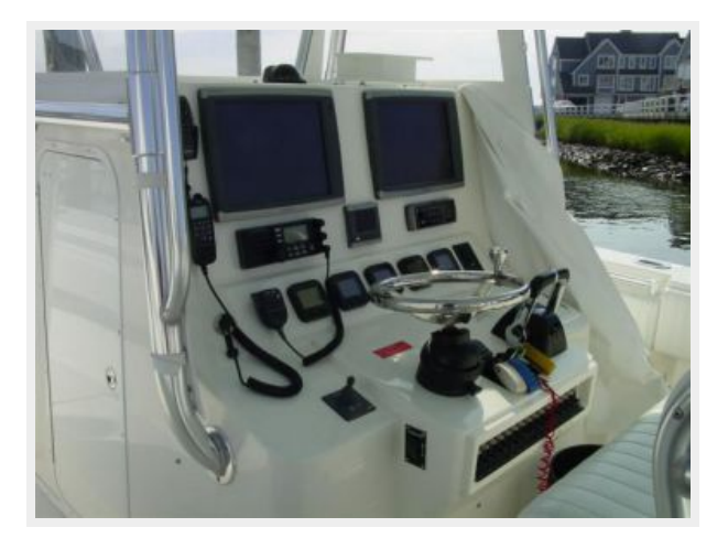
Electronics & Navigation 2