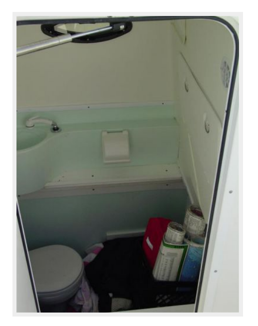
Center Console 2 - Head