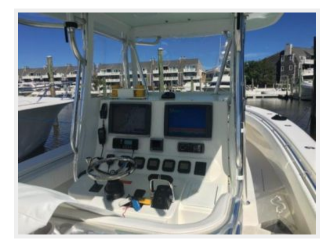
Electronics & Navigation 1