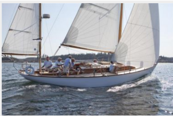
Port Tack Reach