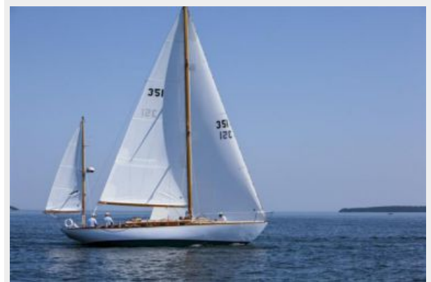
Starboard Tack Beating