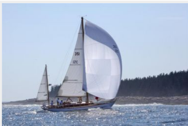
Running Along Maine's Classic Coastline