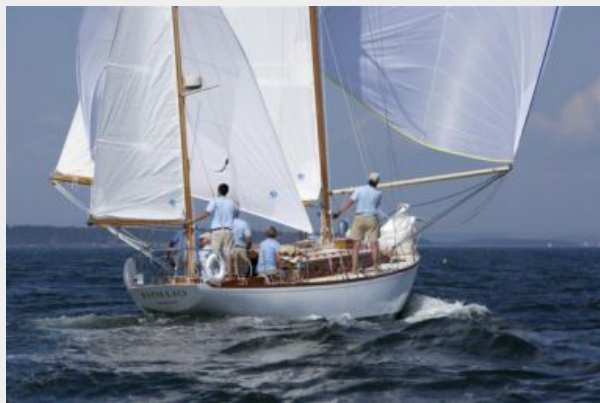
FIDELIO Under Spinnaker