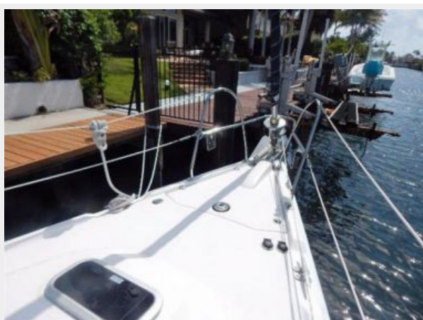
Fore deck - anchor locker