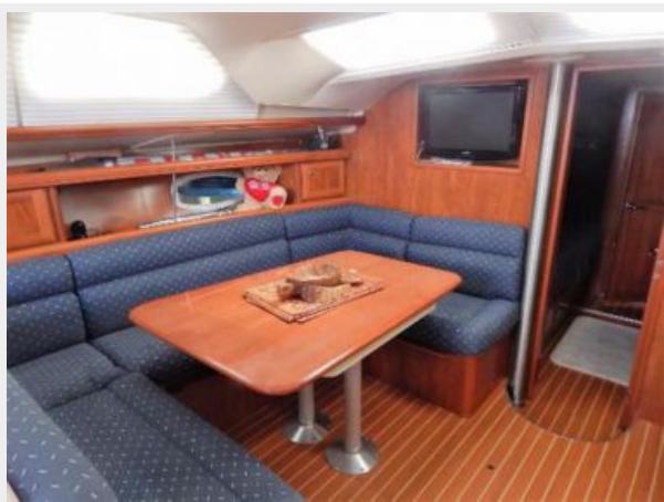
Dinette to Port