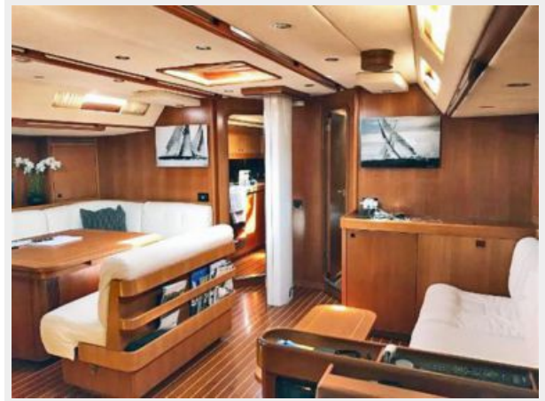
Main Salon, Looking Fwd.