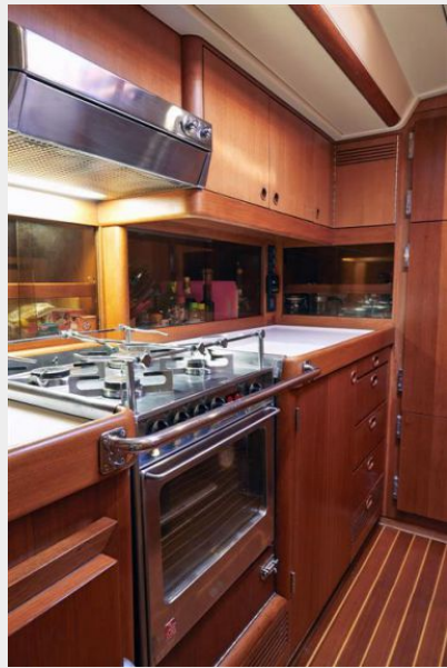
Galley, View Fwd.