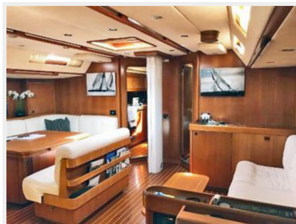
Main Salon, Looking Fwd.