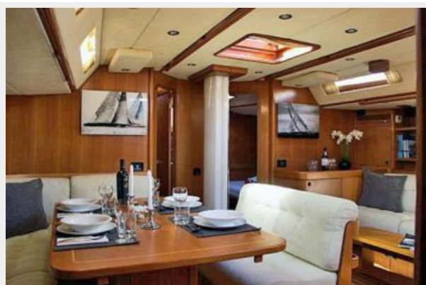
Saloon, Port Side Dining Area