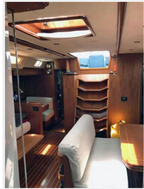
Main Saloon, Looking Aft