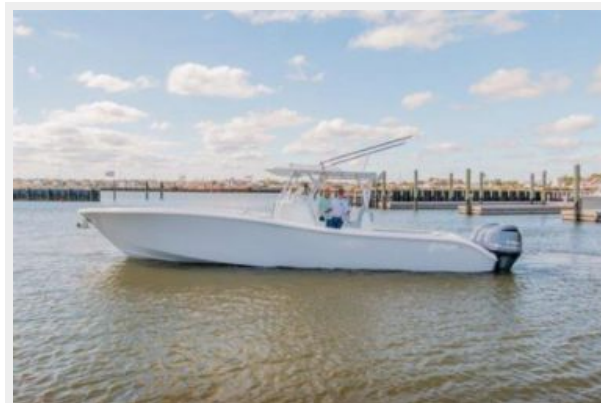
Profile 4 - Running Profile