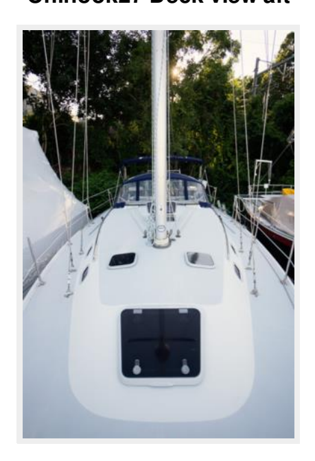
Chinook27 Deck view aft