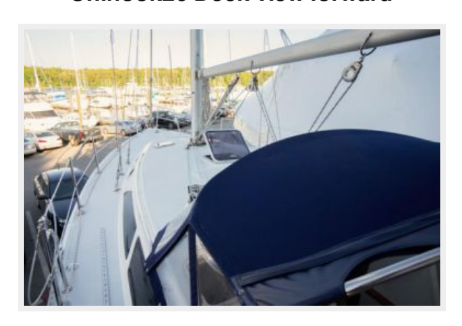
Chinook26 Deck view forward