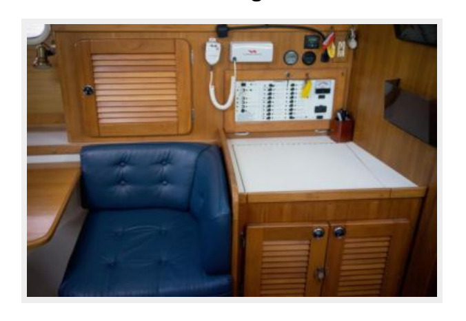
Chinook18 Navigation Table