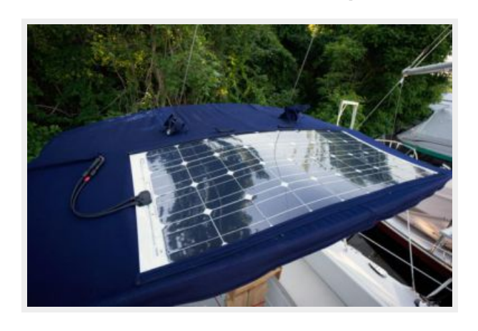
Chinook28 Solbian solar panel