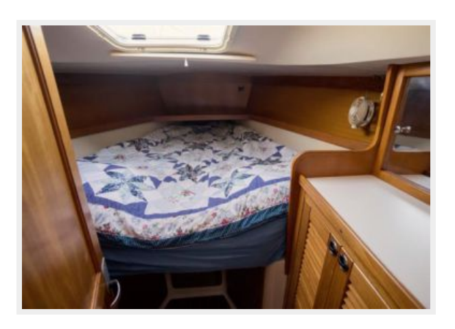
Chinook14 Vee Berth