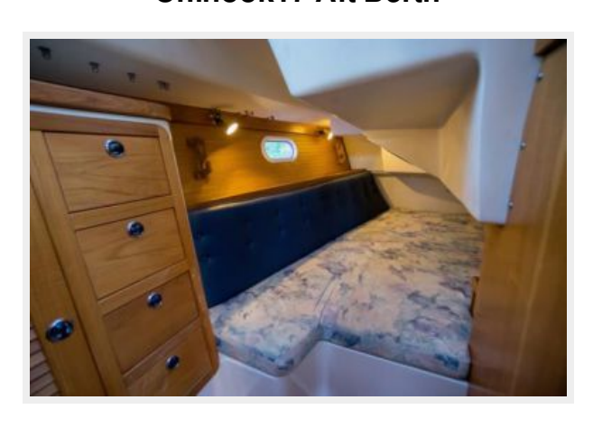
Chinook17 Aft Berth