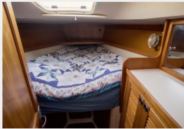
Chinook14 Vee Berth