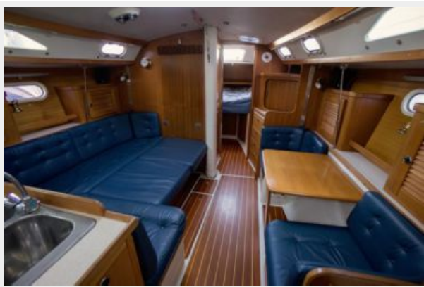
Chinook08 Main saloon convertable double berth