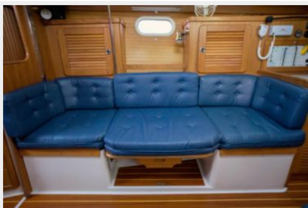
Chinook10 Starboard settee as berth