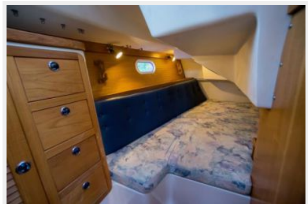
Chinook17 Aft Berth