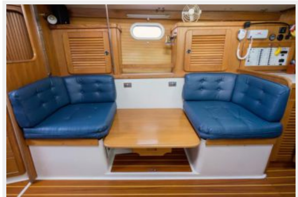
Chinook09 Starboard settee 2.