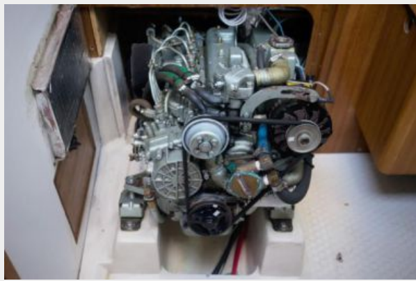
Chinook20 Universal 35B engine