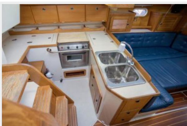
Chinook12 galley 1