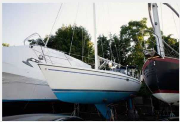
Chinook30 External view 1.