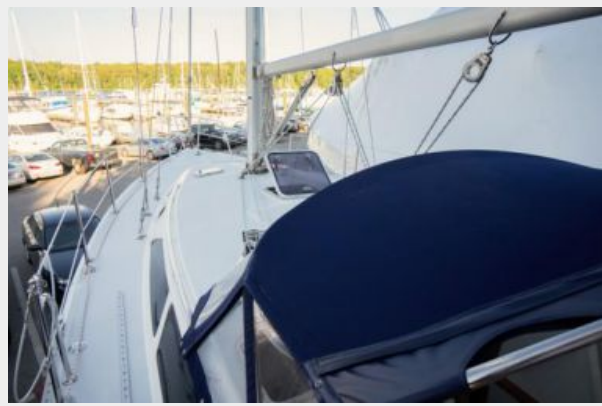
Chinook26 Deck view forward