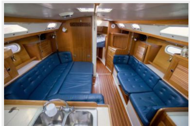
Chinook11 Main saloon with berths