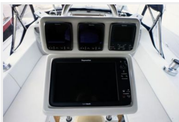
Chinook24 Raymarine navigation pod