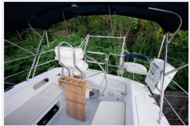
Chinook21 Cockpit view aft