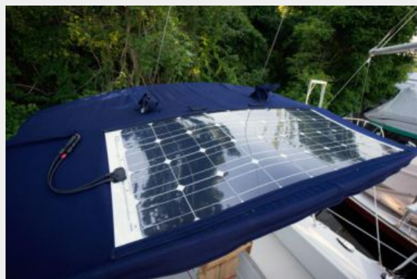
Chinook28 Solbian solar panel