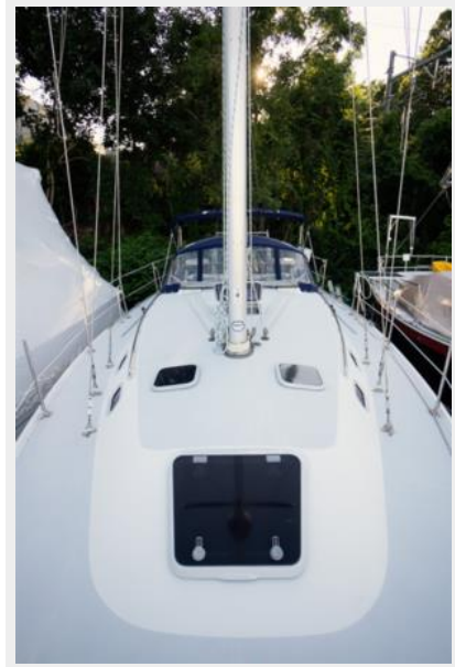
Chinook27 Deck view aft