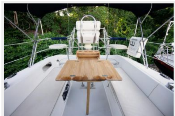
Chinook23 Teak cockpit table