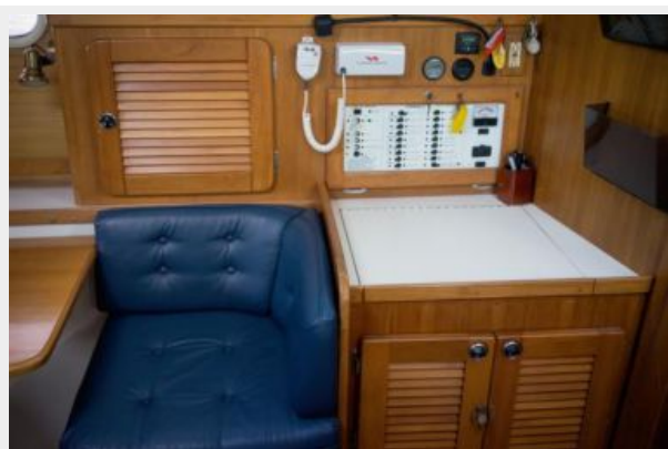
Chinook18 Navigation Table