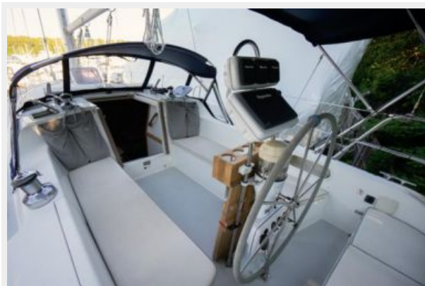
Chinook22 Cockpit view fore