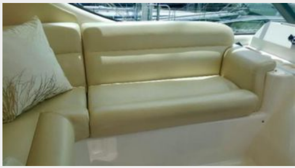
Helm Settee (2)