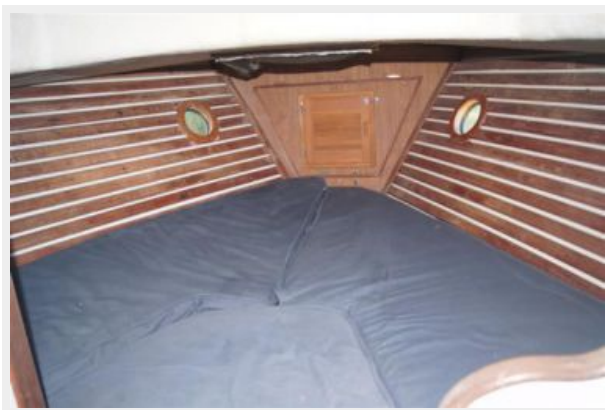
1977 CSY 44 Walkover Saphira vee berth with fill in