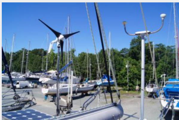
1977 CSY 44 Walkover Saphira wind generator and solar panels