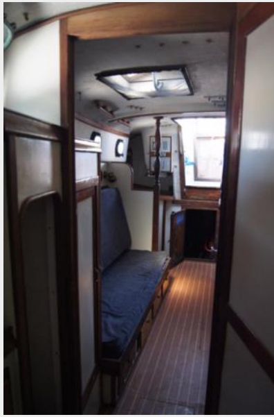
1977 CSY 44 Walkover Saphira passageway looking aft