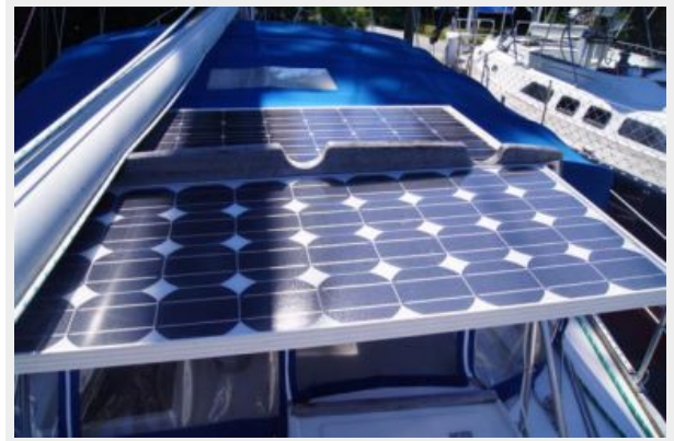
1977 CSY 44 Walkover Saphira solar panels