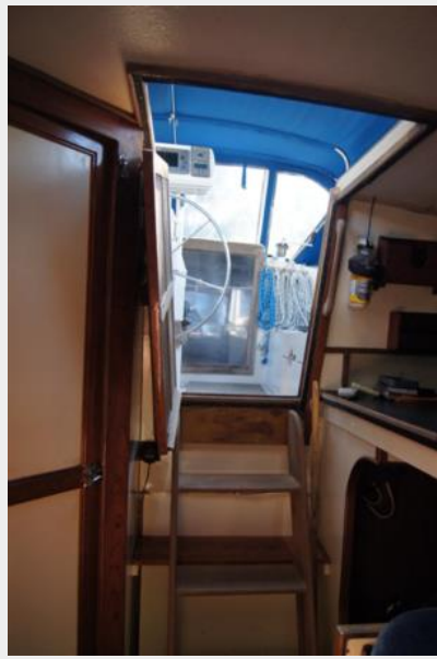
1977 CSY 44 Walkover Saphira aft companionway looking forward