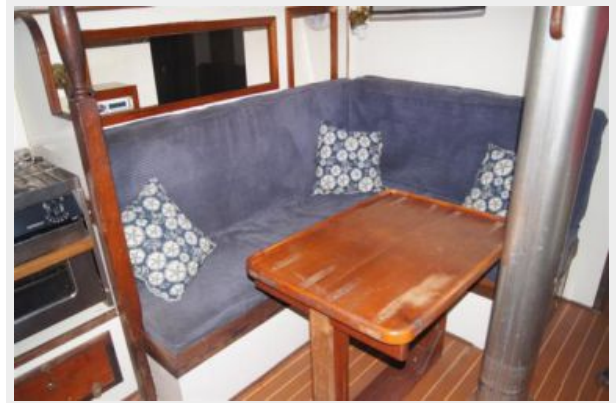
1977 CSY 44 Walkover Saphira galley table