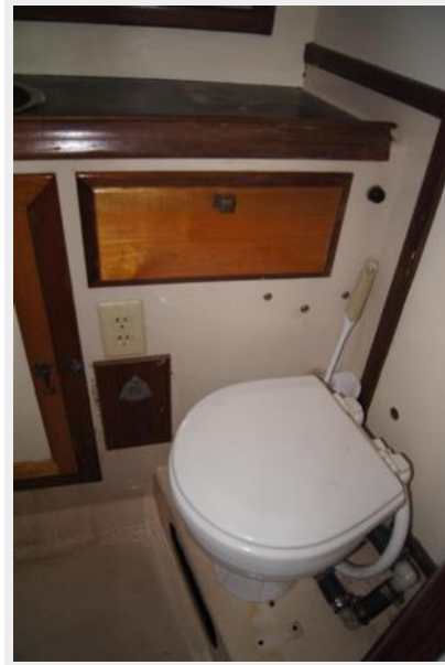
1977 CSY 44 Walkover Saphira forward head 2