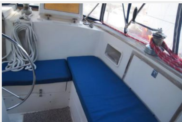
1977 CSY 44 Walkover Saphira cockpit looking forward