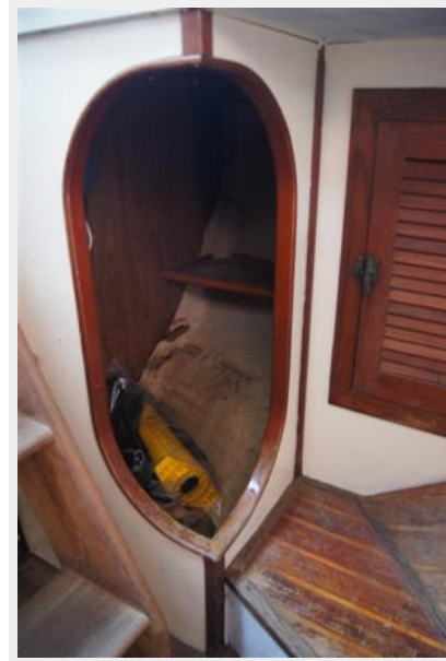
1977 CSY 44 Walkover Saphira master berth storage