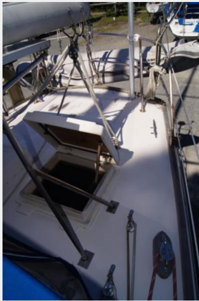
1977 CSY 44 Walkover aft deck