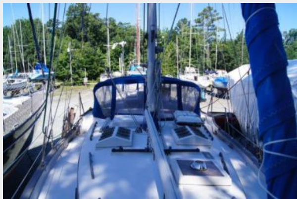
977 CSY 44 Walkover Saphira looking aft