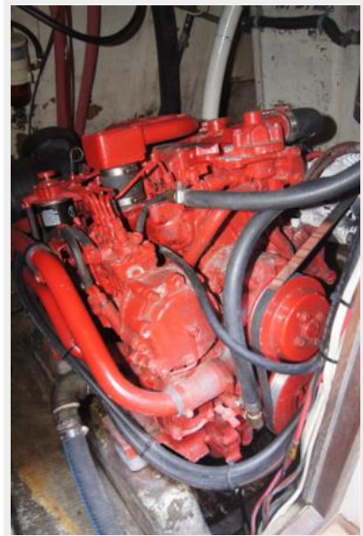
1977 CSY 44 Walkover Saphira engine