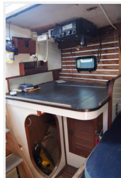
1977 CSY 44 Walkover Saphira chart table and electronics