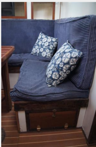
1977 CSY 44 Walkover Saphira galley cushion