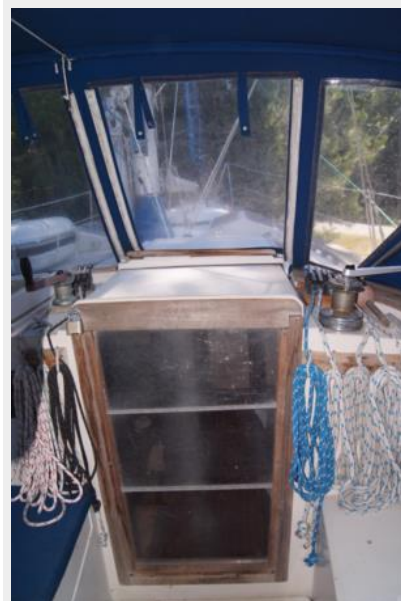
1977 CSY 44 Walkover Saphira companionway going forward