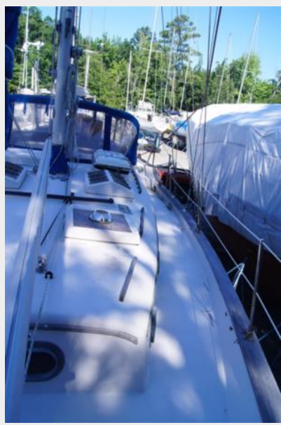
1977 CSY 44 Walkover Saphira port side deck