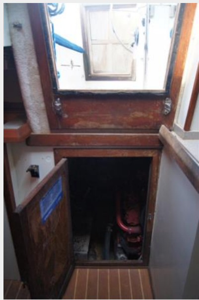
1977 CSY 44 Walkover engine room entry