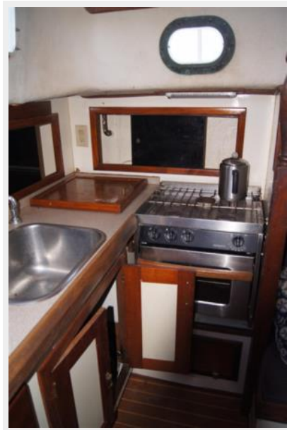
1977 CSY 44 Walkover Saphira galley large view