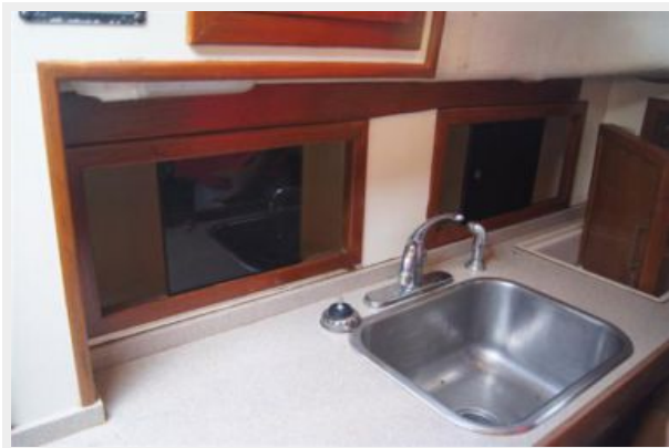
1977 CSY 44 Walkover Saphira countertop and sink