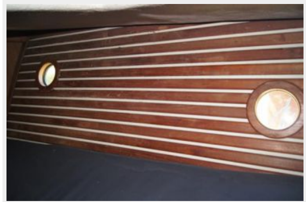
1977 CSY 44 Walkover Saphira forward vee berth and round ports