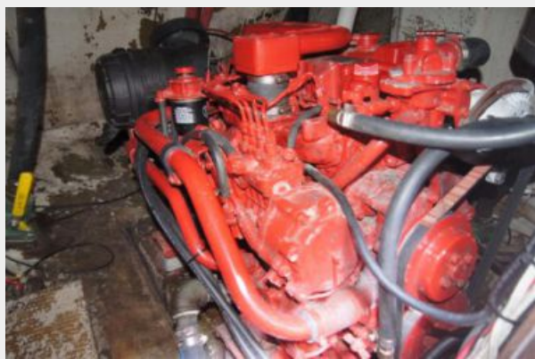
1977 CSY 44 Walkover Saphira engine 2