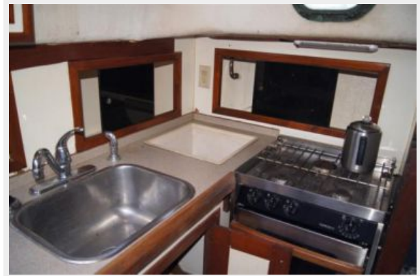
1977 CSY 44 Walkover Saphira galley sink and stove