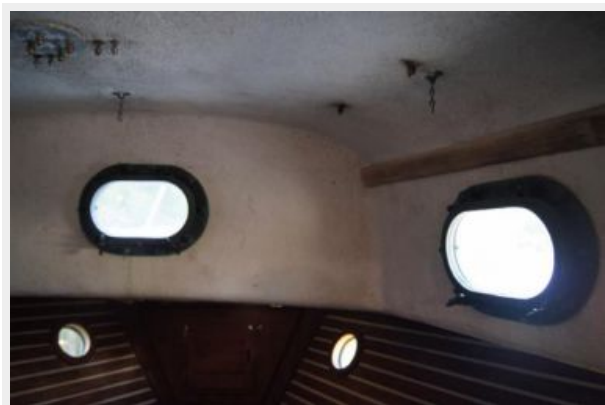
1977 CSY 44 Walkover Saphira forward berth overhead