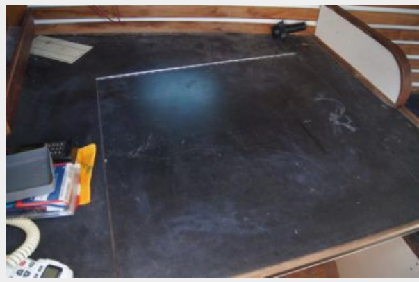
1977 CSY 44 Walkover Saphira aft chart table