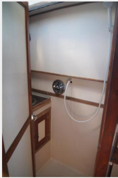
1977 CSY 44 Walkover Saphira master shower