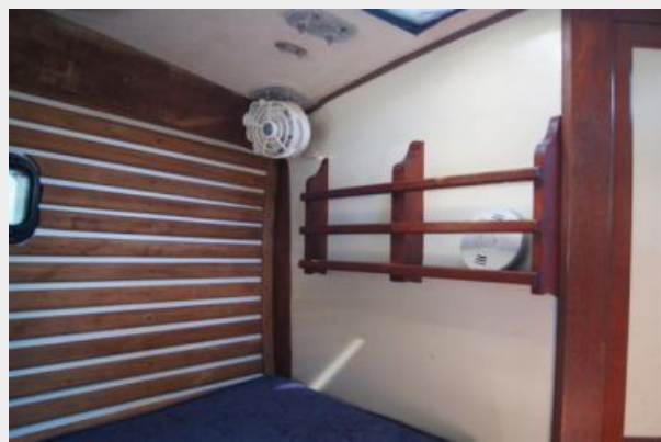
1977 CSY 44 Walkover Saphira wood trim and rack