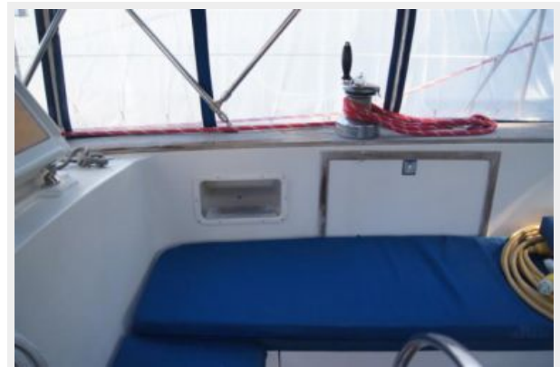
1977 CSY 44 Walkover Saphira cockpit port side