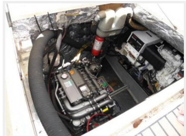
Engine Room #2