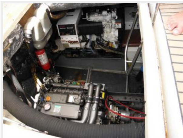
Engine Room #1