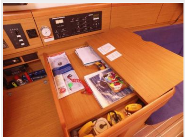
Chart Table Storage