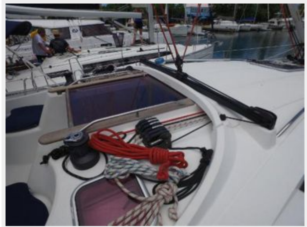
Starboard Rope Clutches and Winch