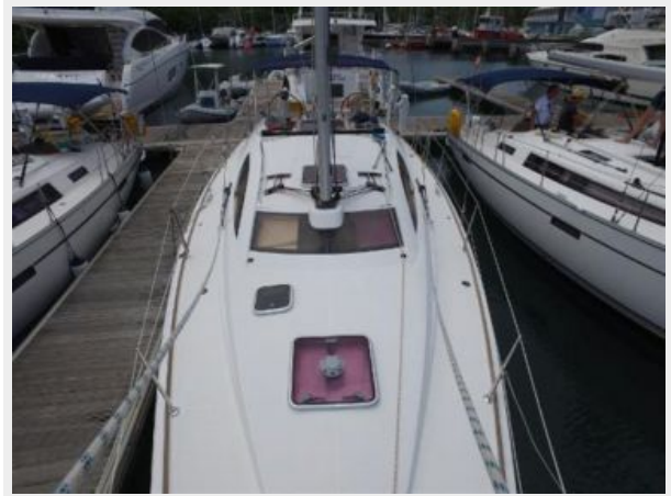
Looking aft from the bow