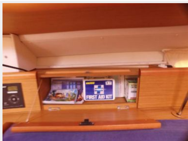
Storage above Port Setee