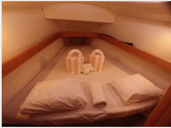
Forward VIP Cabin