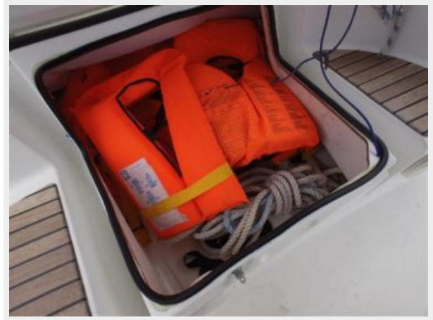
Starboard cockpit locker