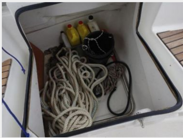
Port cockpit locker