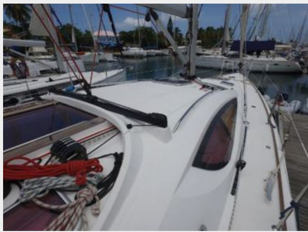
Starboard weather deck