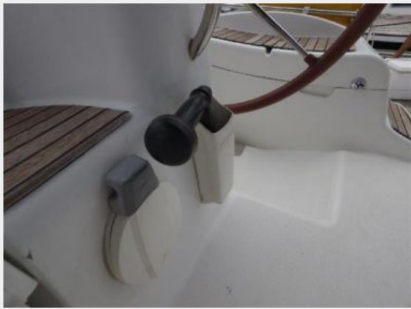
Manual Bilge Pump and Winch Handle Pocket