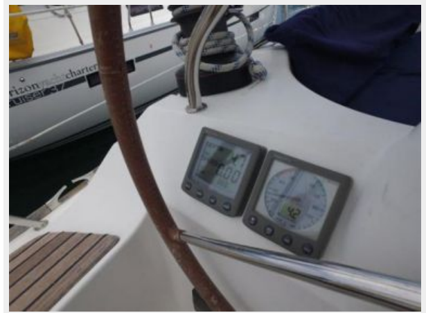
Port side helm electronics