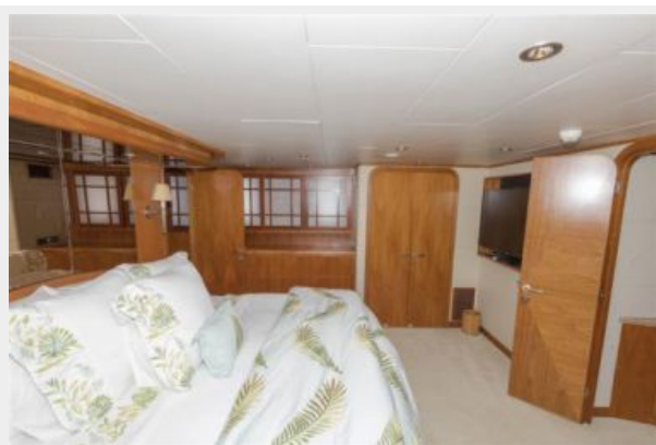
Master to Port