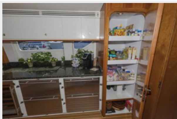
Extra Refrigeration & Pantry