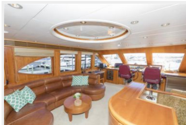
Skylounge Looking Forward