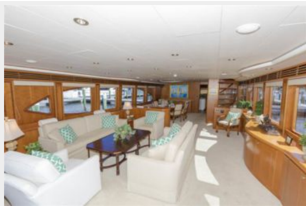
Salon Looking Foward