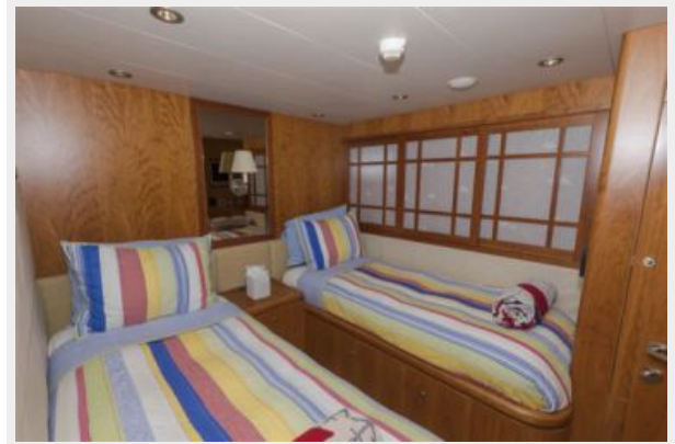
Port Guest Looking Forward