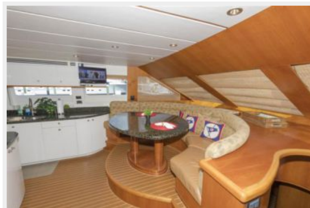
Galley/Dining to Port