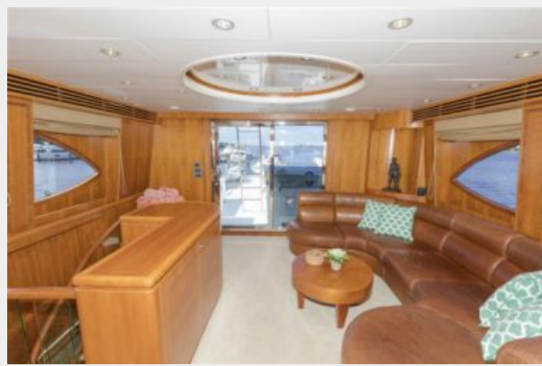
Skylounge Looking Aft