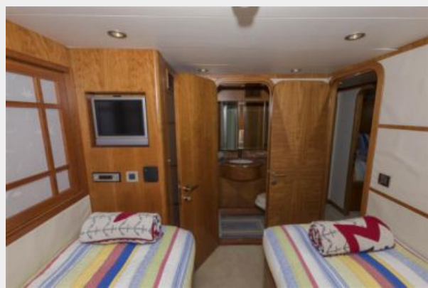
Port Guest Looking Aft