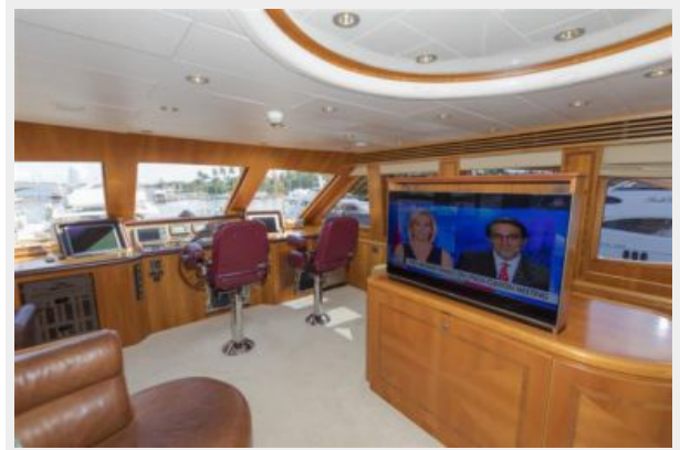
New 49" 4K TV