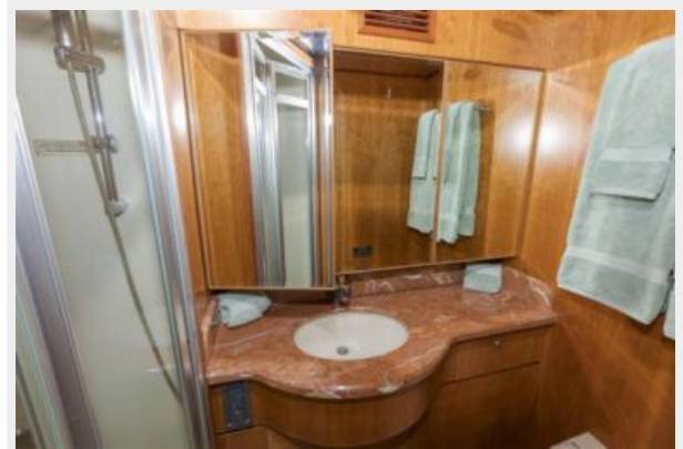
Port Guest Head