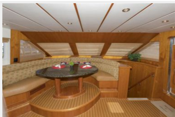
Country Kitchen Dining