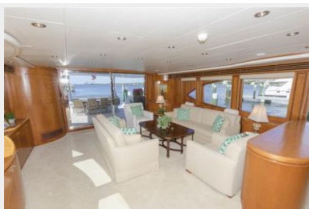
Salon Looking Aft to Port