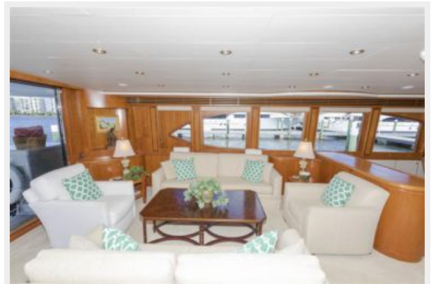
Salon Looking to Port