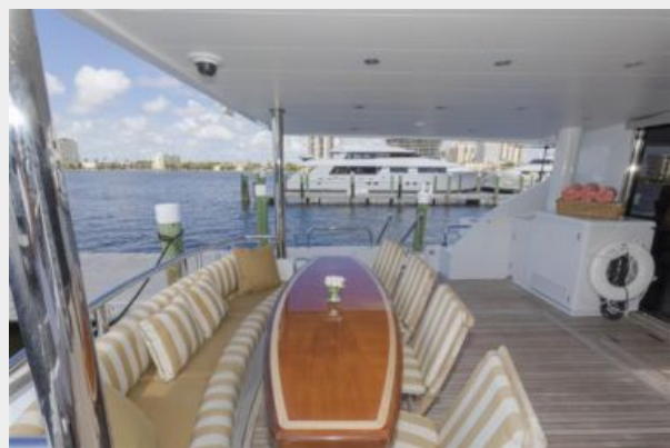
Aft Deck Looking to Port