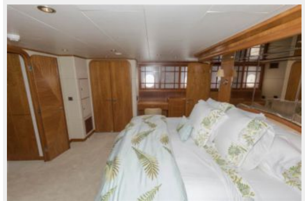
Master to Starboard