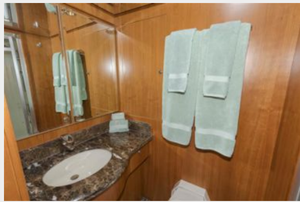
Starboard Guest Head