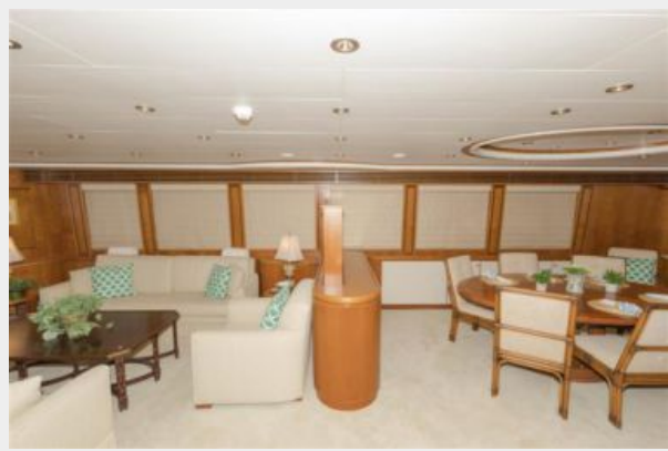
Salon/Dining Looking to Port