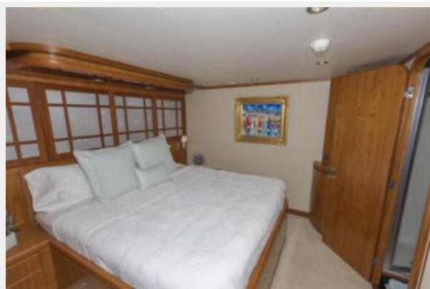
VIP Looking Forward