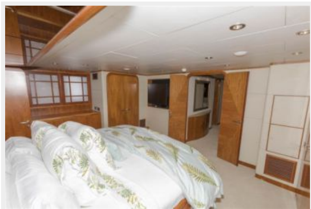
Master to Port