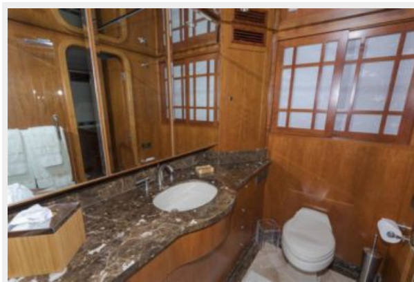
Port Master Head