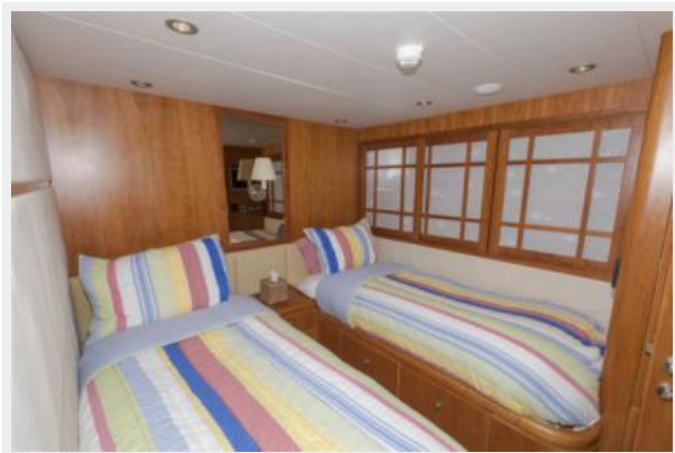
Starboard Guest Looking Aft