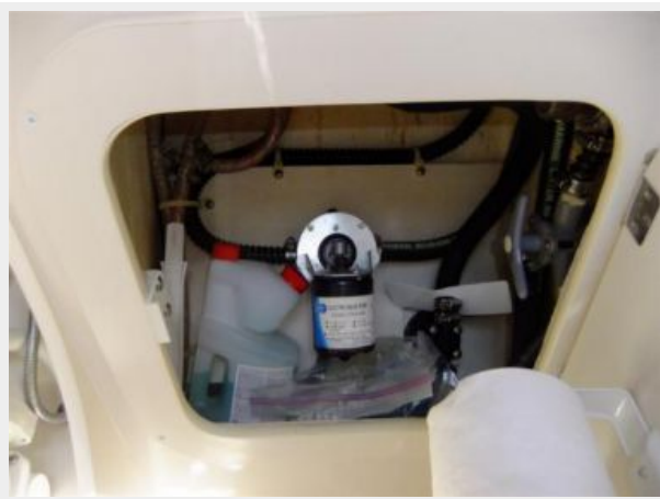
Catalina 310 Cheri-Lynn Split Head - Three way pump