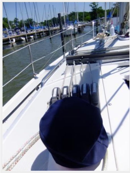
Catalina 310 Cheri-Lynn Cockpit Port Forward Blocks & Winch