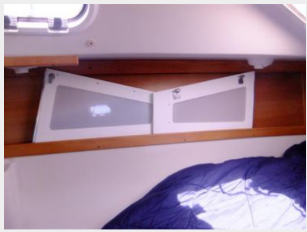
Catalina 310 Cheri-Lynn Forward Berth Side Storage & Companionway Custom Door Inserts