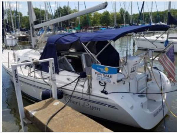
Catalina 310 Cheri-Lynn Port Aft Profile