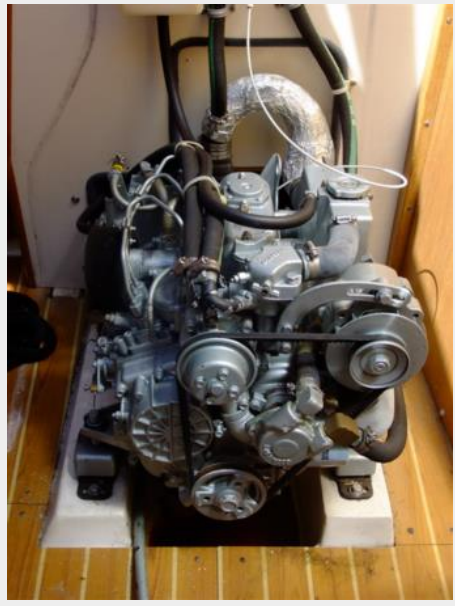
Catalina 310 Cheri-Lynn Engine Front View