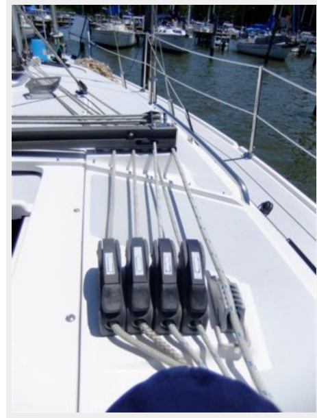
Catalina 310 Cheri-Lynn Cockpit STBD Forward