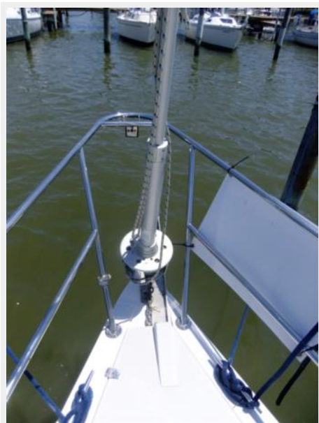
Catalina 310 Cheri-Lynn Deck Feature - Roller Furler