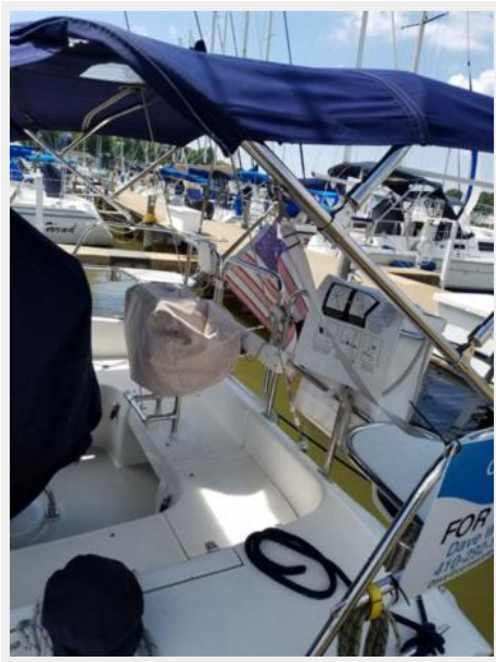
Catalina 310 Cheri-Lynn Cockpit Dodger and Full Bimini Aft Profile