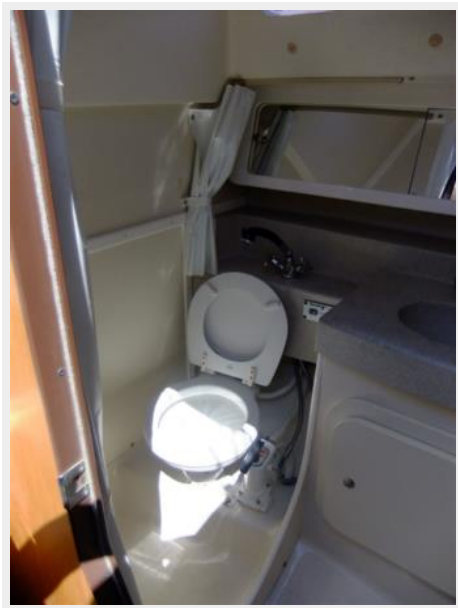
Catalina 310 Cheri-Lynn Split Head