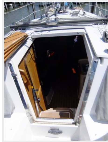
Catalina 310 Cheri-Lynn Companionway