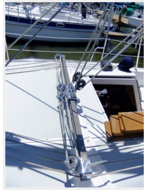
Catalina 310 Cheri-Lynn Deck Feature - Traverler