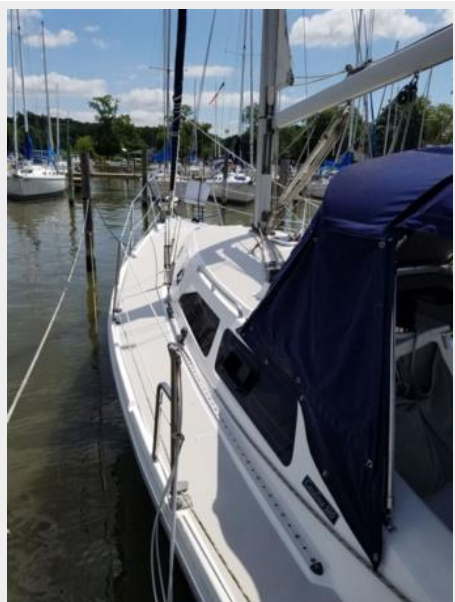
Catalina 310 Cheri-Lynn Port Forward Profile 2