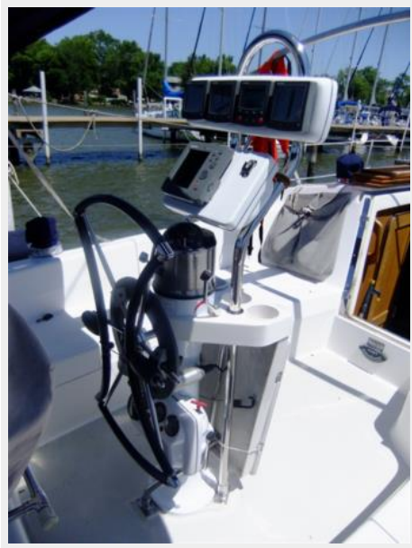
Catalina 310 Cheri-Lynn Cockpit Pedestal