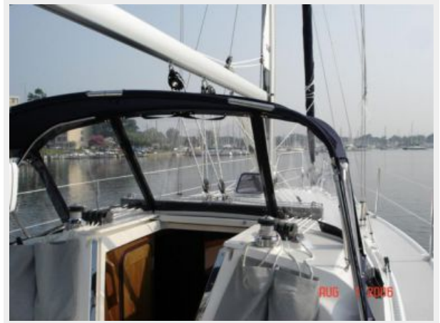
Catalina 310 Cheri-Lynn Cockpit Dodger Forward