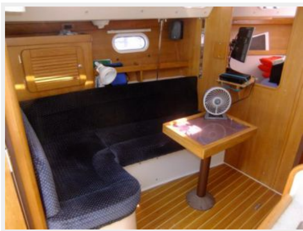
Catalina 310 Cheri-Lynn Salon Dinette