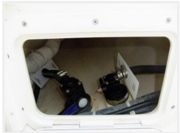
Catalina 310 Cheri-Lynn Split Head - Controls