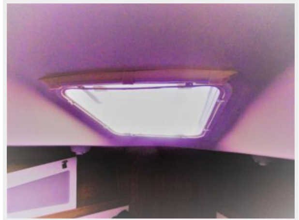
Catalina 310 Cheri-Lynn Forward Berth Overhead Hatch & Screen