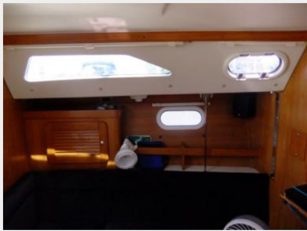
Catalina 310 Cheri-Lynn Salon Dinette 2.