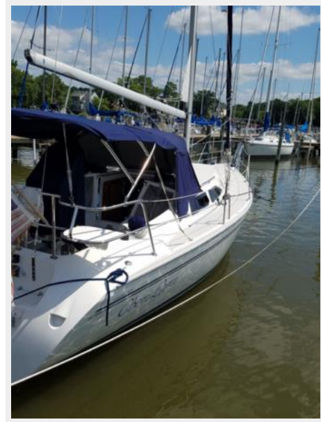
Catalina 310 Cheri-Lynn STBD Aft Profile