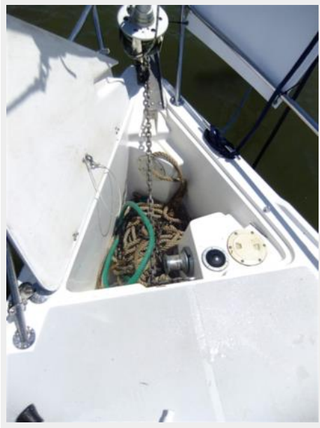
Catalina 310 Cheri-Lynn Deck Forward - Anchor Locker Open