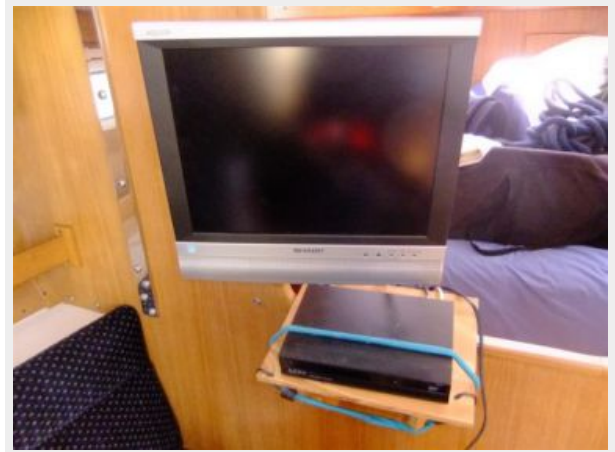
Catalina 310 Cheri-Lynn Salon Dinette & TV