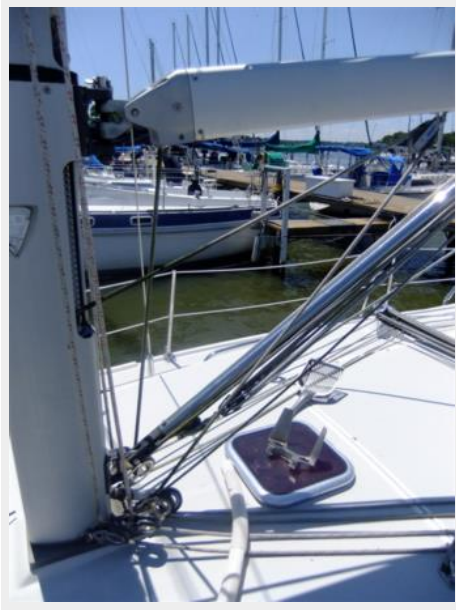
Catalina 310 Cheri-Lynn Deck Feature - Boom Vang