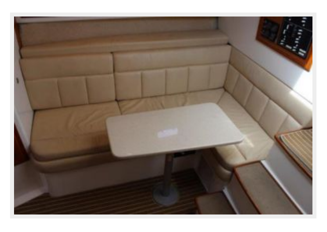
Salon 2 - Dinette