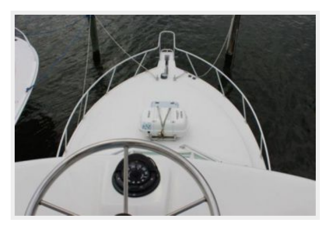
Deck 2 - View From Tower