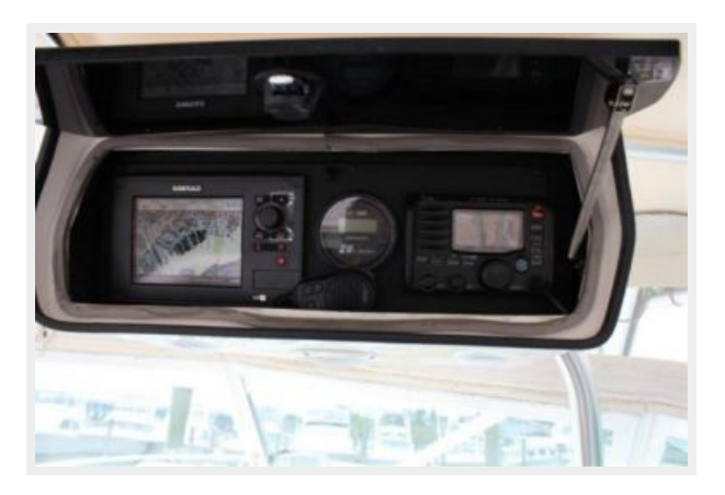
Helm / Electronics & Navigation 5 - Radio Box