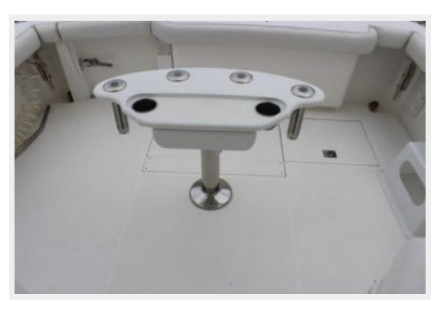
Cockpit / Fishing Equipment 2 - Rocket Launcher