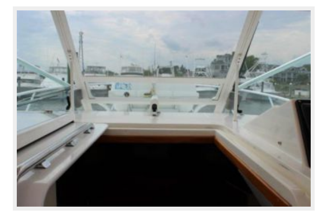
Deck 10 - Center Windshield Vent