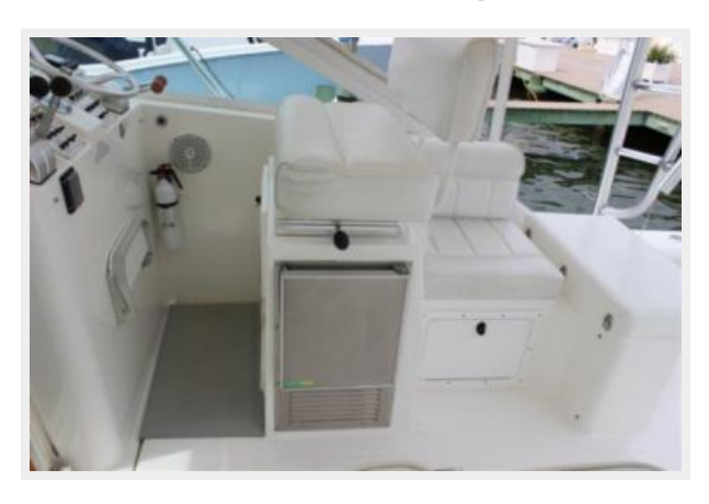
Deck 4 - Helm & Jump Seat