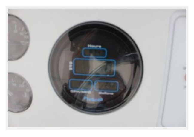
Helm / Electronics & Navigation 4 - Tach, Flow Scan & Hour Meter