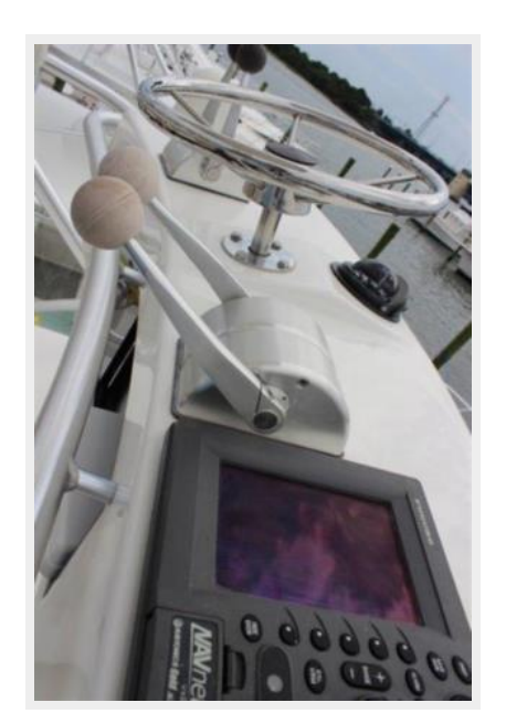
Helm / Electronics & Navigation 8 - Tower Network Monitor