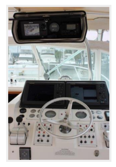
Helm / Electronics & Navigation 1