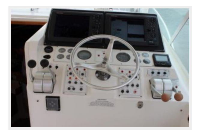
Helm / Electronics & Navigation 2