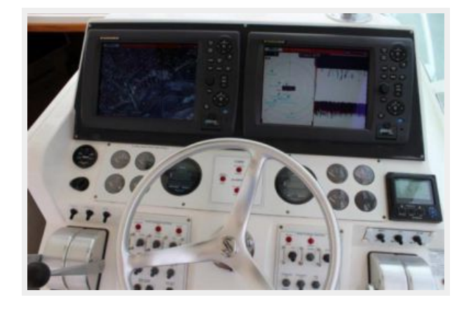
Helm / Electronics & Navigation 3