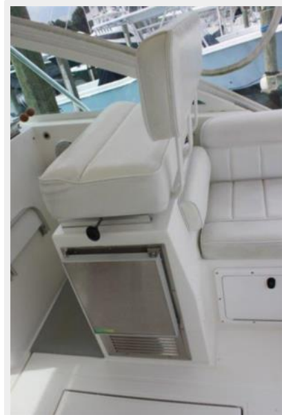
Deck 5 - Helm Seat & Ice Maker