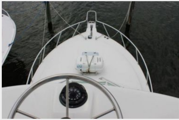
Deck 2 - View From Tower