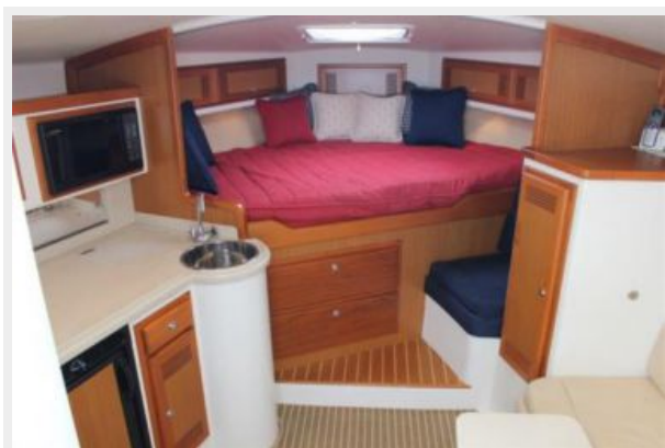
Master Stateroom 1