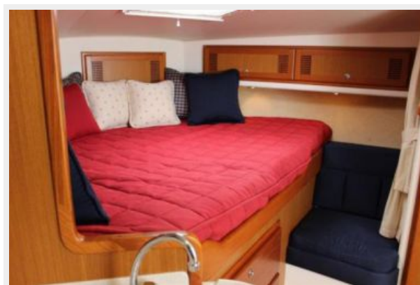
Master Stateroom 2 - Forward Berth