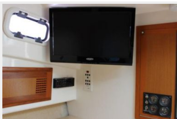
Salon 4 - TV