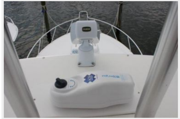
Deck 5 - Helm Seat & Ice Maker