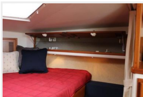
Master Stateroom 3 - Storage