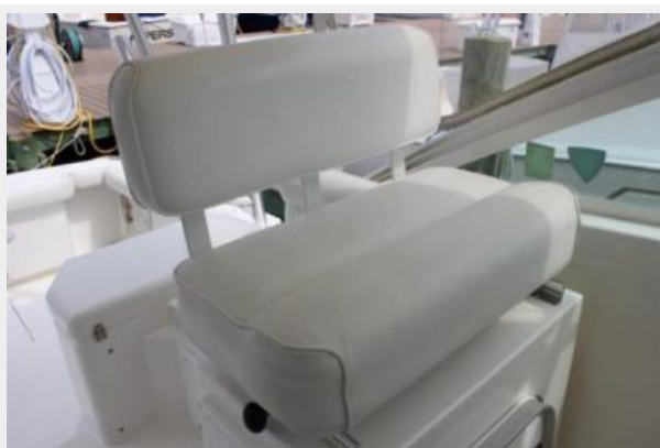
Deck 6 - Companion Seat