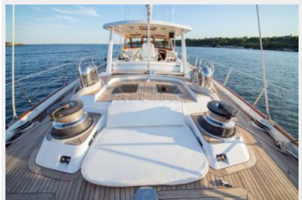
Aft Deck Sunpad