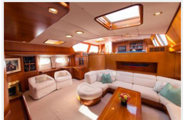
Main Salon, Looking Aft