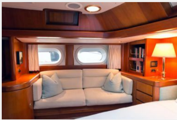
Master Stbd. Settee