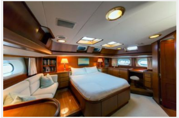
Master Cabin, to Port