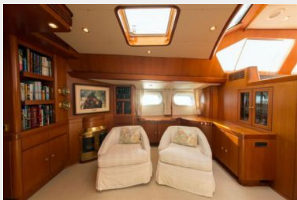
Main Salon, Stbd. Side