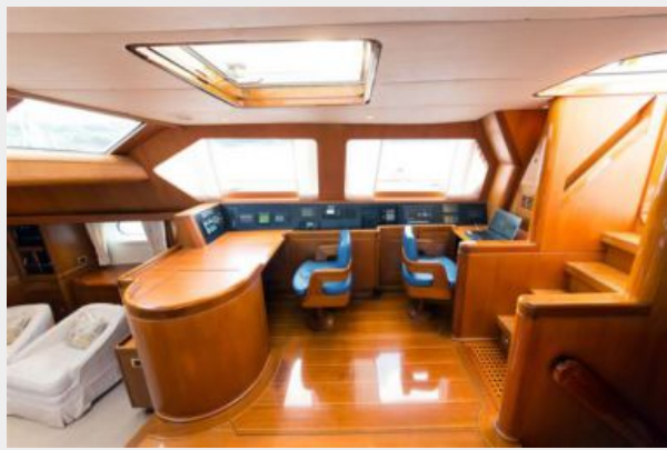
Office Navigation Area