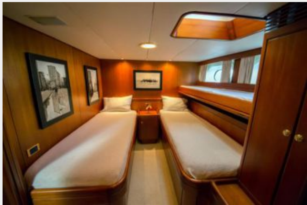
Port Guest Cabin with Pullman Deployed