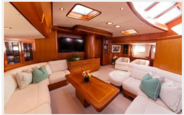
Main Salon, Looking Fwd.