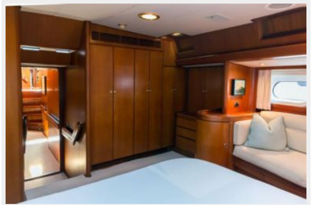
Master Cabin, Looking Forward