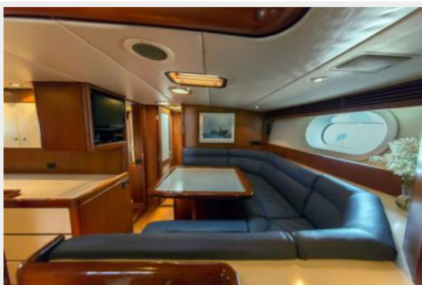
Crew Dinette, Looking Forward