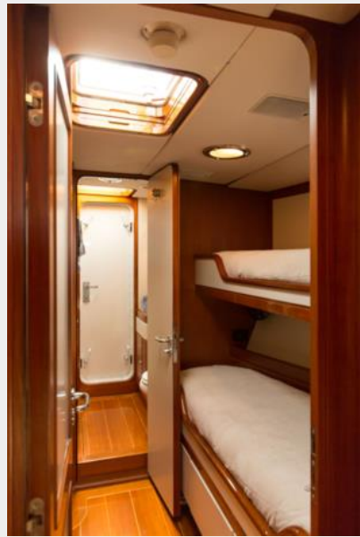
Stbd. Crew Cabin