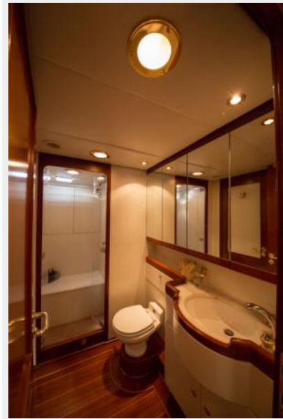
Port Guest Head