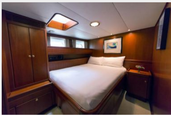
Stbd. Guest Cabin, Queen Configuration