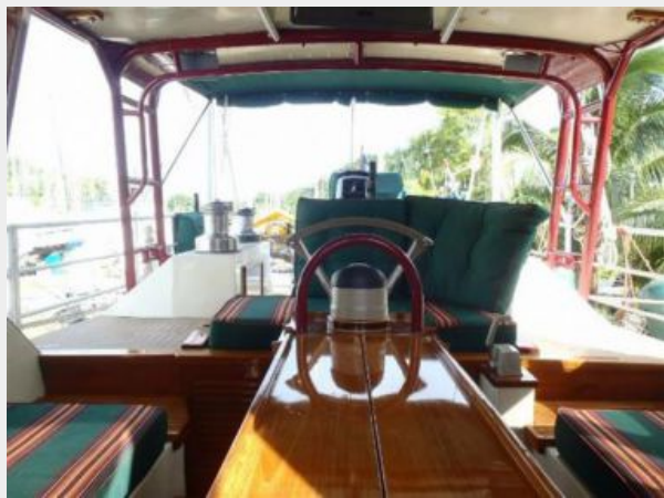
Pilothouse looking aft