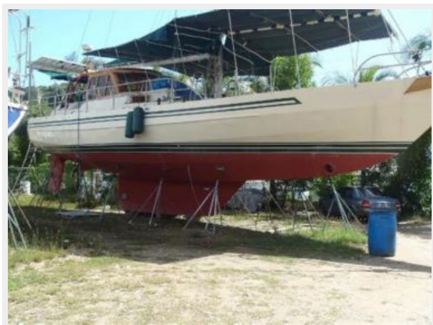
Out of the water