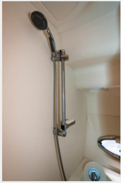
Master Stateroom Shower