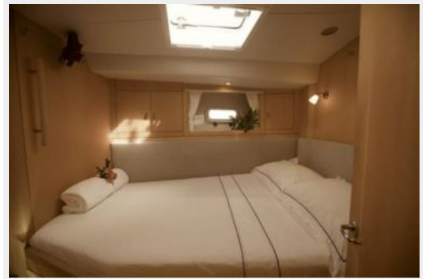
Stbd. Guest Cabin