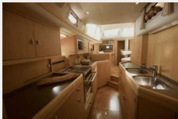
Galley, Looking Fwd.