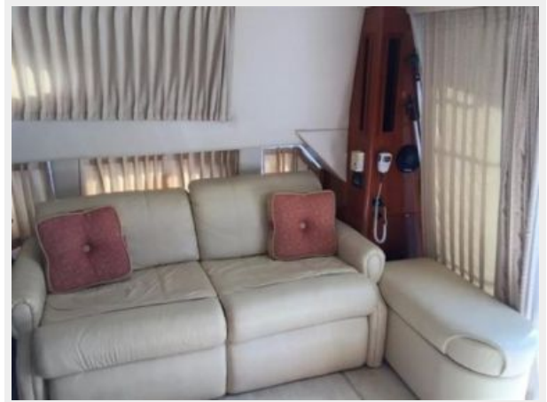
Sleeper sofa and ottoman.