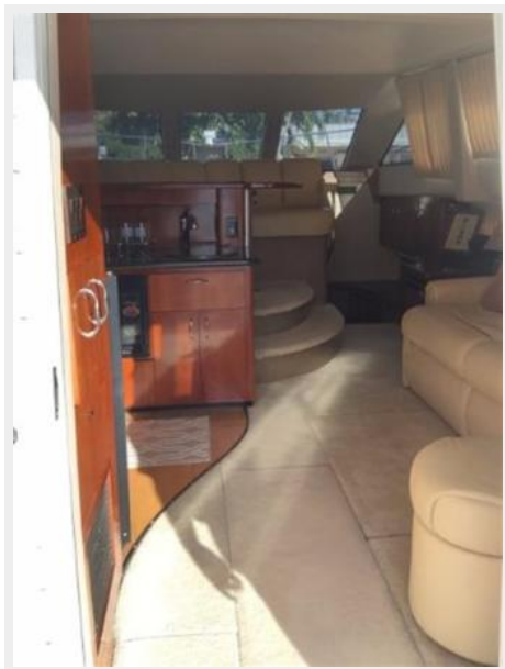
Looking forward into the Salon