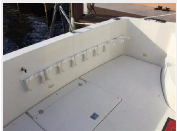
8 dive tank folding racks