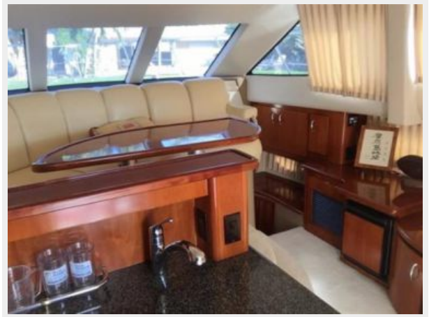
Raised dinette offers expansive views