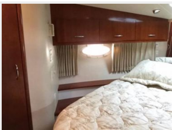
Port side of Owner's fwd cabin