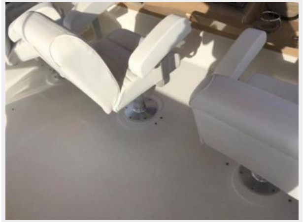
2014 new vinyl upholstery