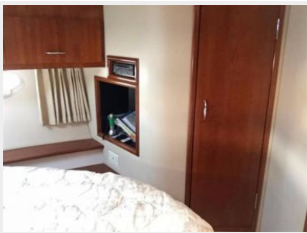
Old CRT TV has been removed