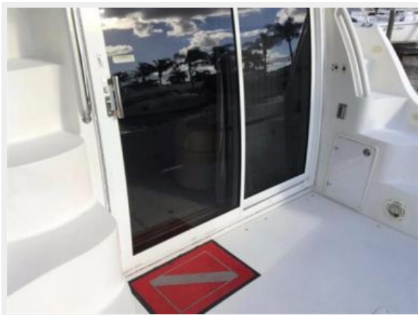
Large sliding door to Salon