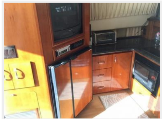
Port side Galley & Entertainment System