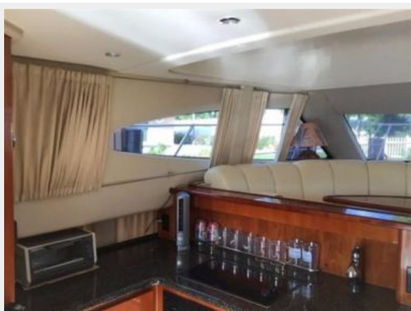
About 270° views from the Galley