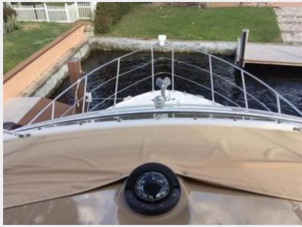
Helm sun cover