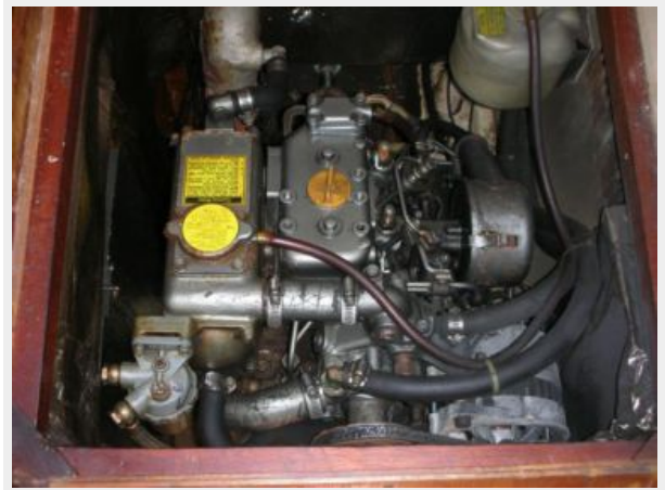
Reve engine 2