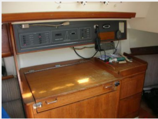
Reve chart station 2