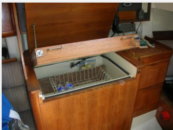
Reve chart station