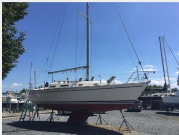
Reve starboard 3