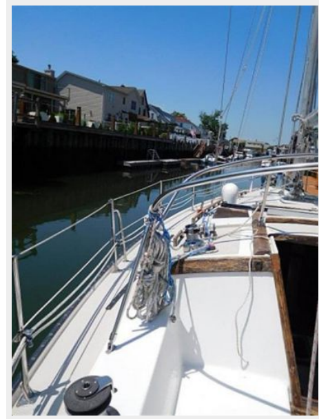
36' Catalina port deck