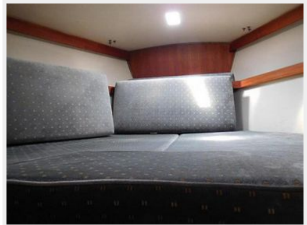
36' Catalina forward stateroom v-berth with insert