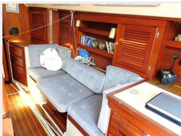
36' Catalina convertible settee and single berth