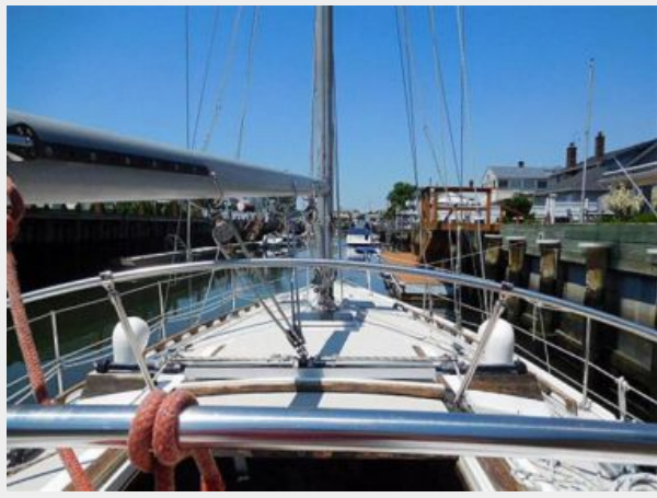
36' Catalina toward bow