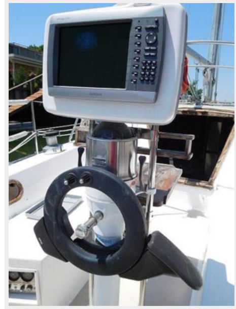
36' Catalina helm and Garmin