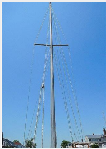
36' Catalina mast