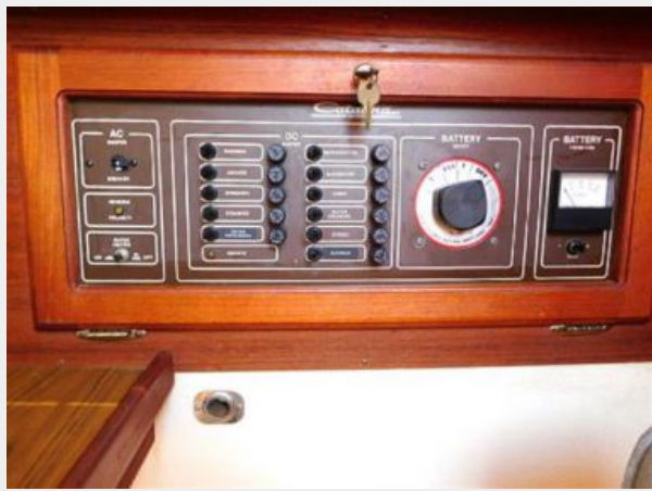
36' Catalina breaker panel