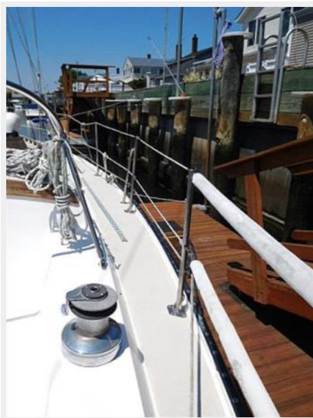
36' Catalina starboard deck