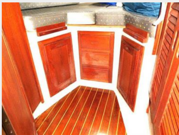
36' Catalina forward stateroom storage