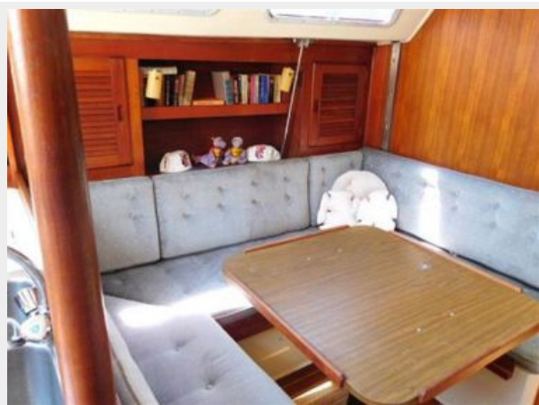
36' Catalina convertible dining table and settee