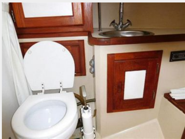
36' Catalina head