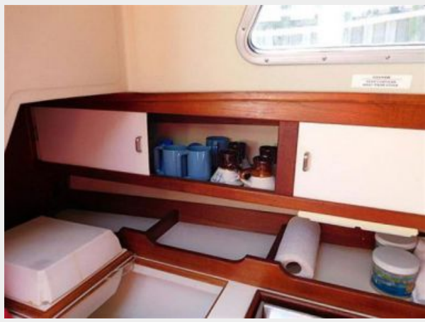
36' Catalina galley storage