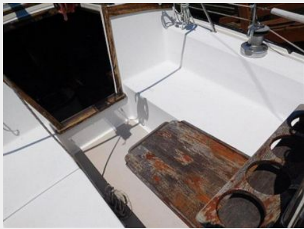
36' Catalina cockpit table