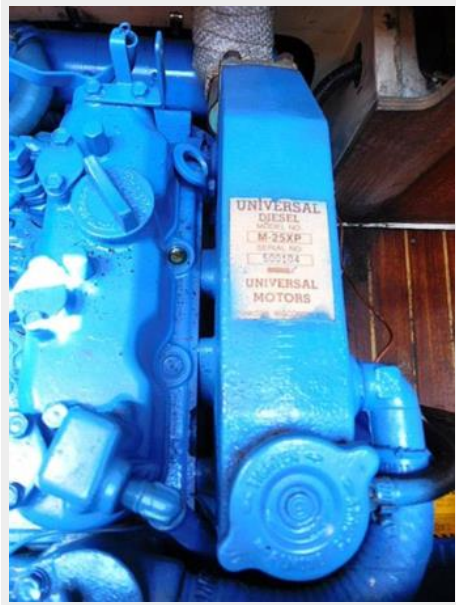
36&apos Catalina engine top view