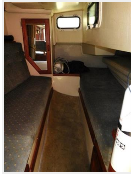
36' Catalina aft stateroom