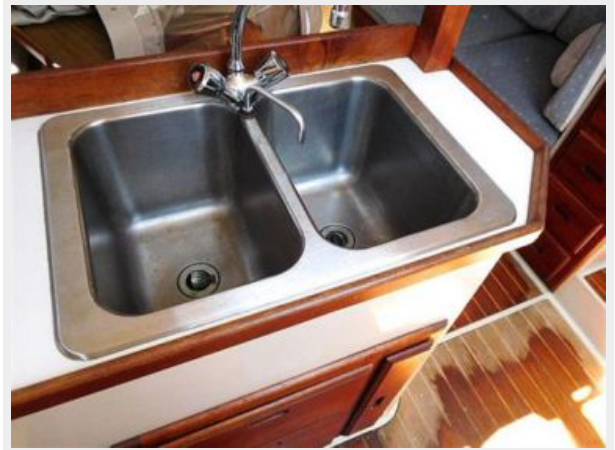
36' Catalina double stainless steel sink