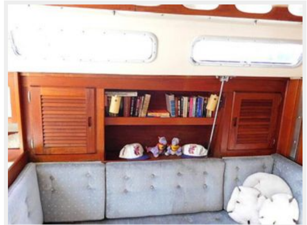
36' Catalina settee and storage