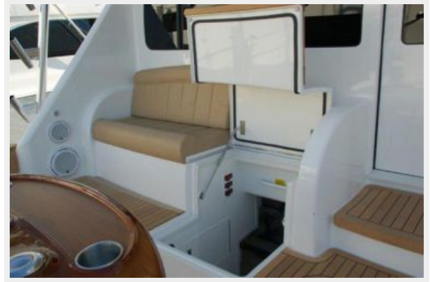
Cockpit / Fishing Equipment 2