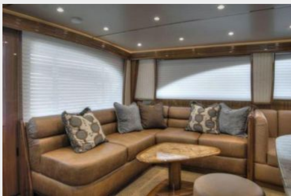
Salon 1 - Sofa