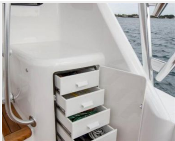
Cockpit / Fishing Equipment 5 - Tackle Center