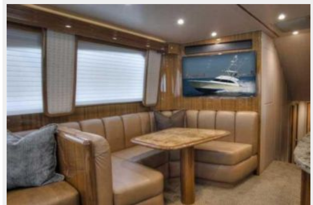
Salon 2 - Dinette