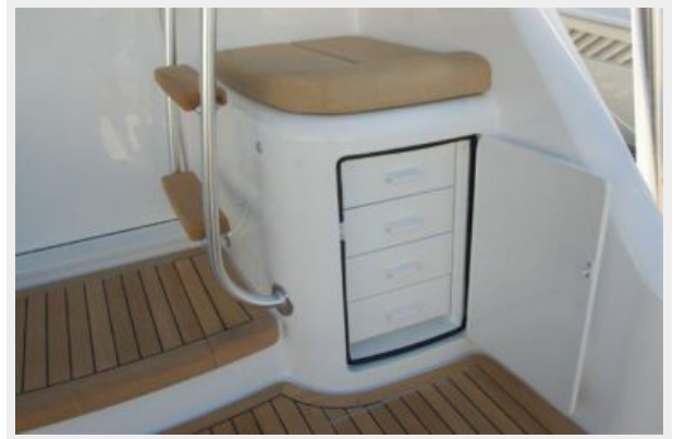
Cockpit / Fishing Equipment 4