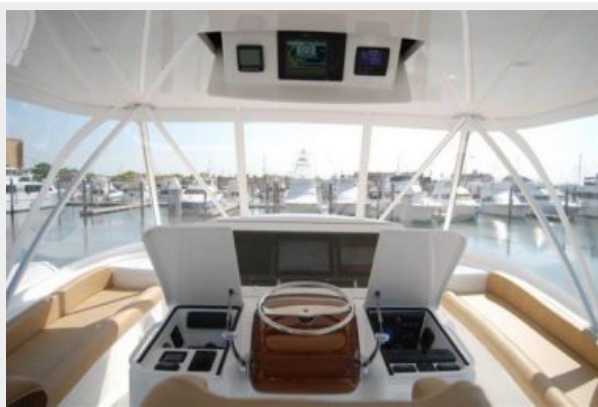
Electronics & Navigation 1