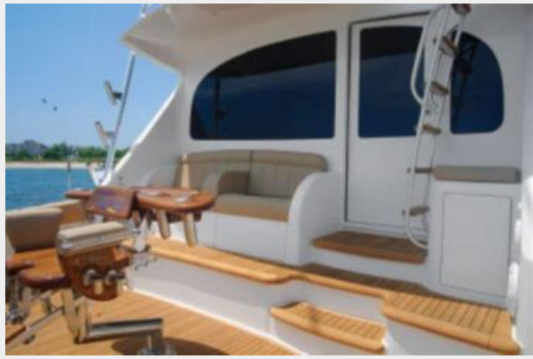
Cockpit / Fishing Equipment 1 - Cockpit