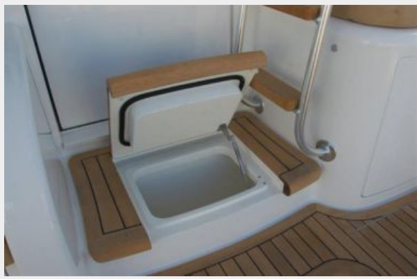
Cockpit / Fishing Equipment 3