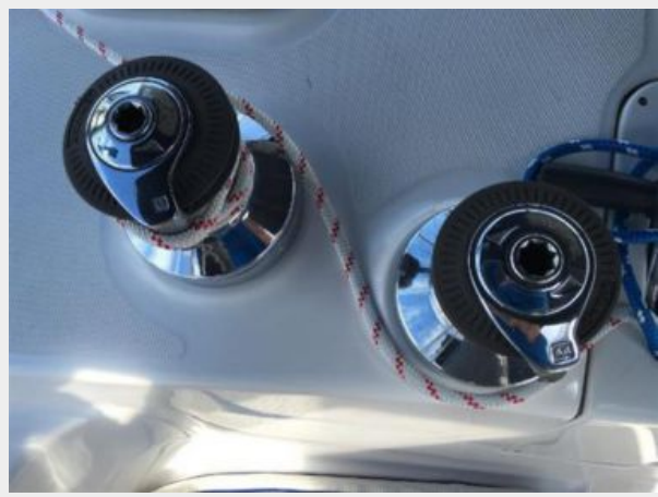
46 Hunter 2004