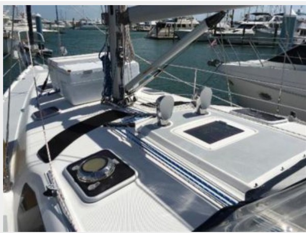
46 Hunter 2004