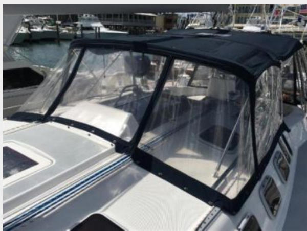
46 Hunter 2004