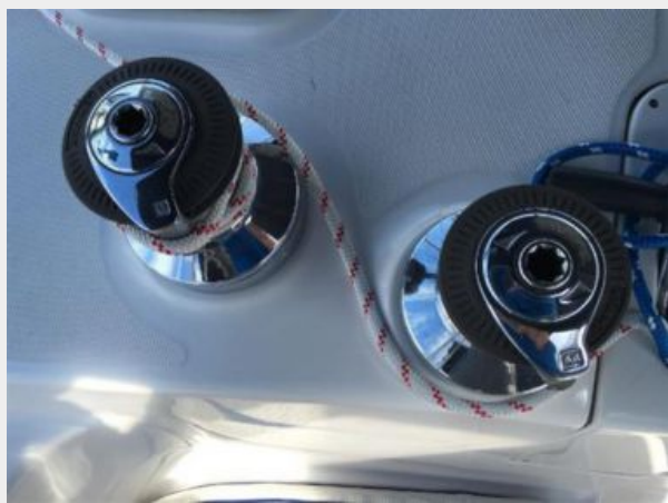
46 Hunter 2004