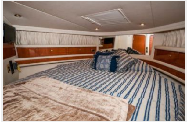
Master Stateroom TV