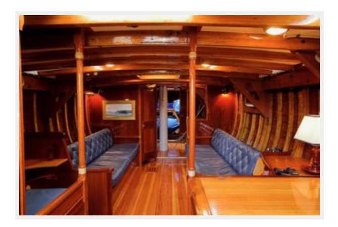
Fully Appointed Classic Interior - Looking Forward