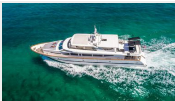
Aerial Port Profile