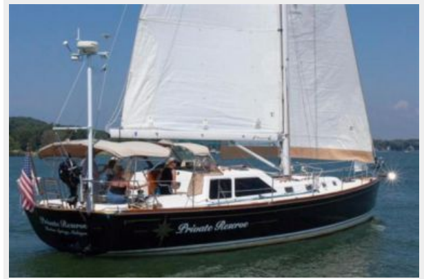
2 Aft Starboard