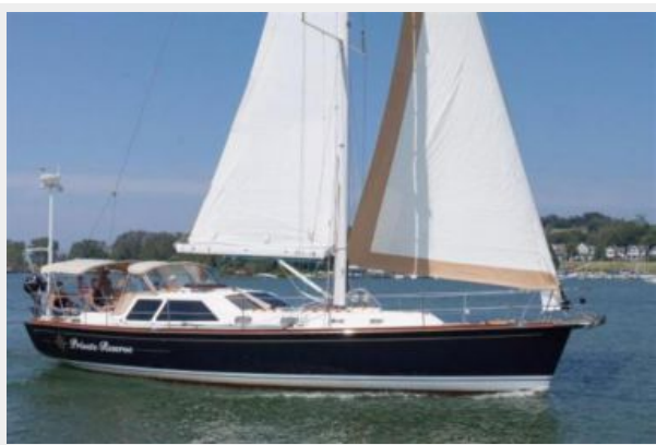
1 Starboard Profile