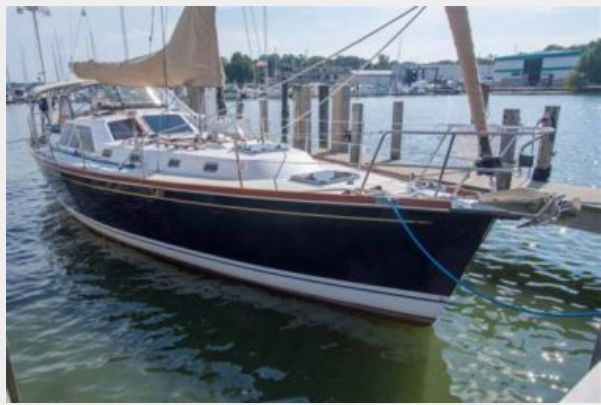
30 At dock side