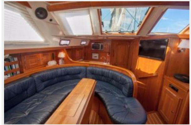
14 Salon looking forward