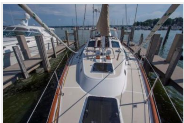
5 At dockside - 2