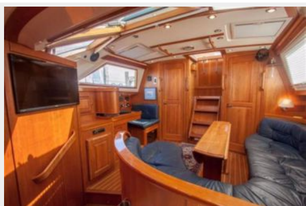
23 Salon looking aft and Starboard