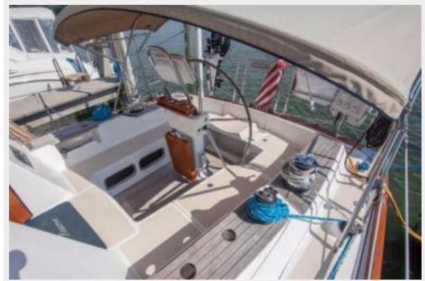
9 Helm - 2