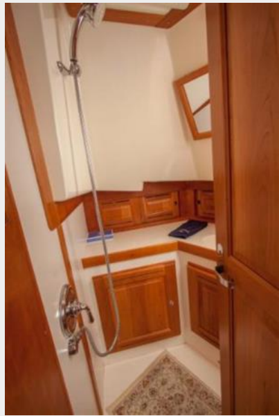
25 Midship Head - Portside