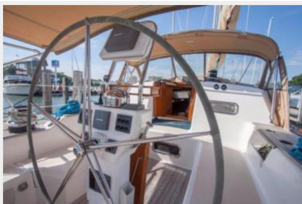
11 Helm - 3