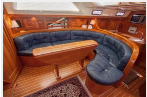
16 Salon looking Port