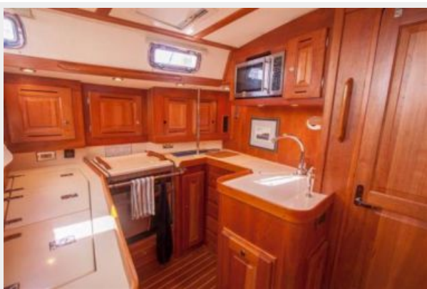
17 Galley open and bright to the Port - One step down