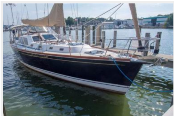
30 At dock side