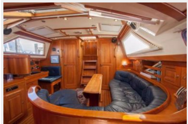
22 Salon looking aft