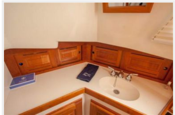
26 Midship Head - 2