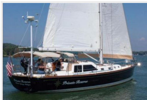
2 Aft Starboard