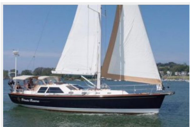
1 Starboard Profile