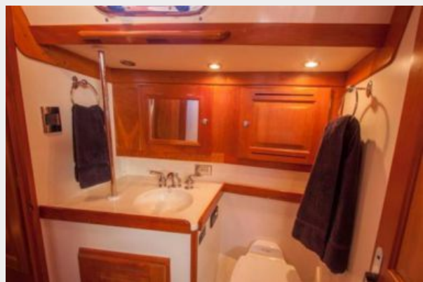
21 Master head vanity and storage