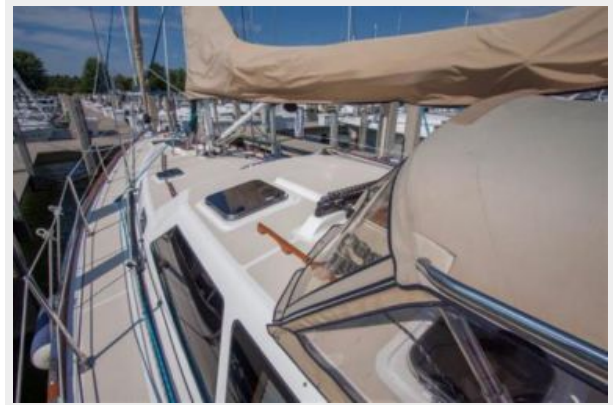
8 At dock side - 5