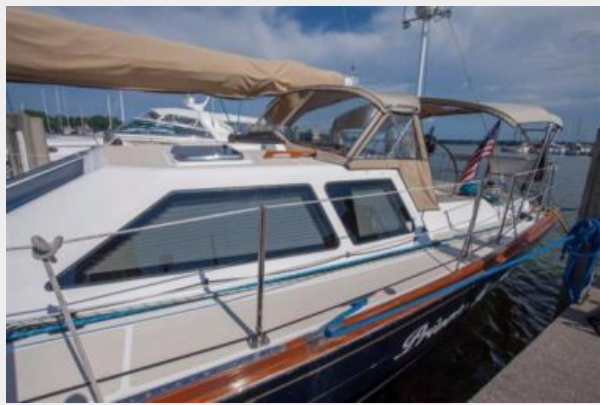
7 At dockside - 4