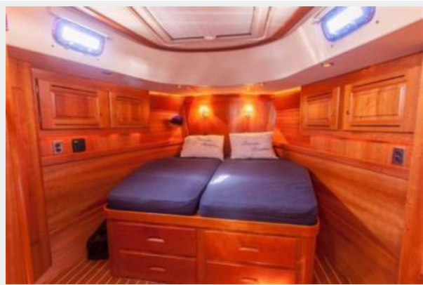
19 Forward Berth Island Queen - Lots of storage