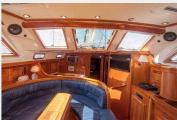
15 Salon looking forward - 2