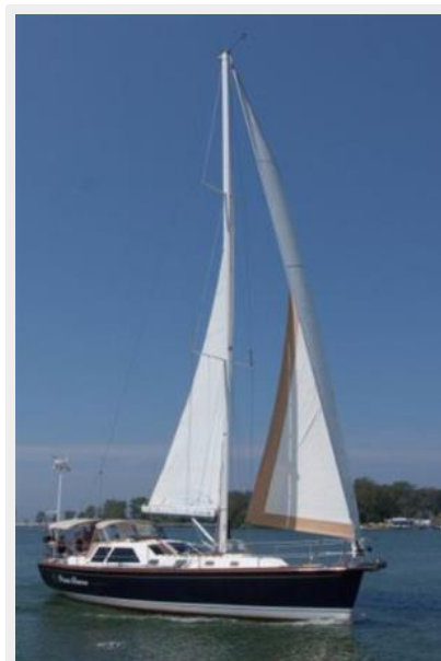
4 Starboard Profile - 2