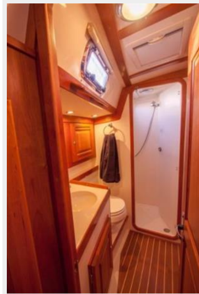
20 Master head looking aft and to Starboard - Lots of room