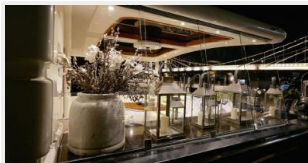
Aft Deck at Night