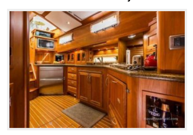
52 Sabre Galley