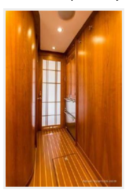
52 Sabre Companionway