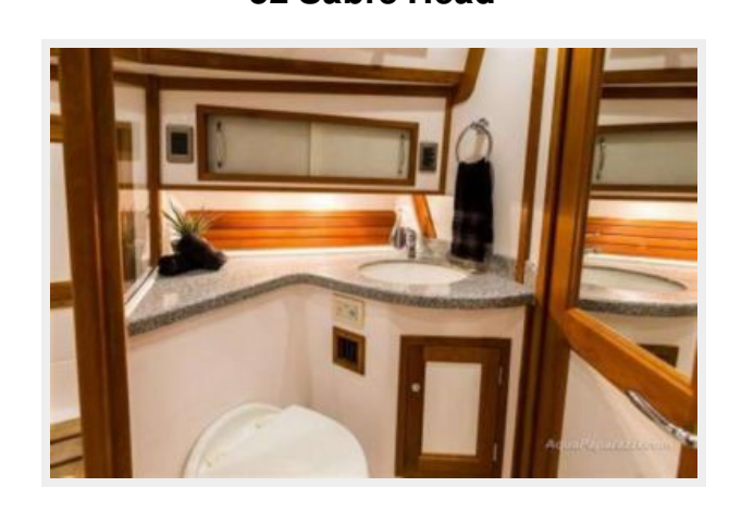
52 Sabre Head