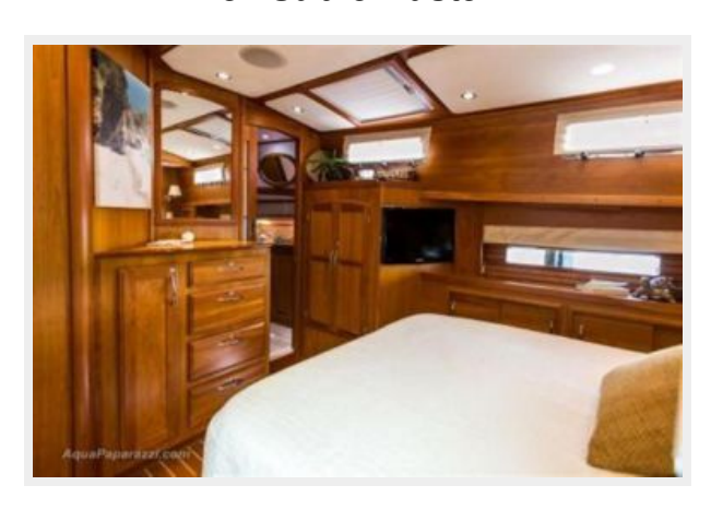
52 Sabre Master