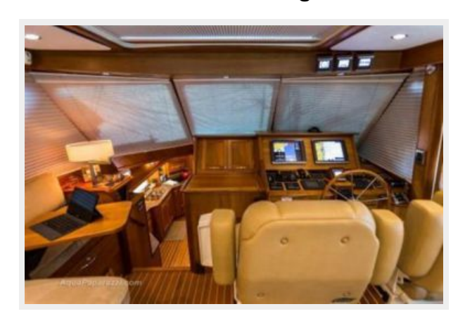
52 Sabre Helm Looking Forward