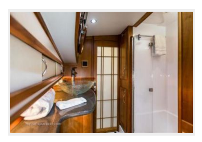
52 Sabre Head