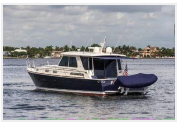
52 Sabre w/ Dinghy