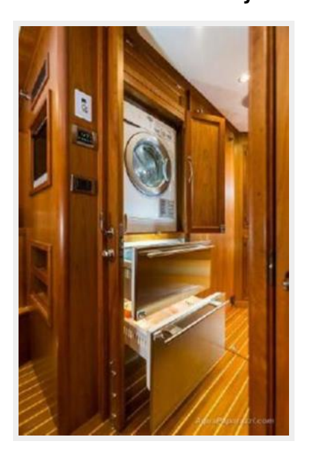
52 Sabre Washer Dryer