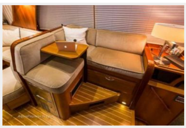
52 Sabre Seating