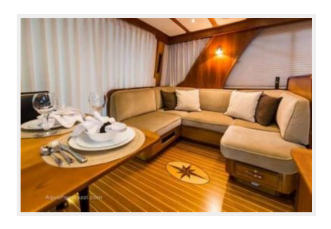
52 Sabre Salon