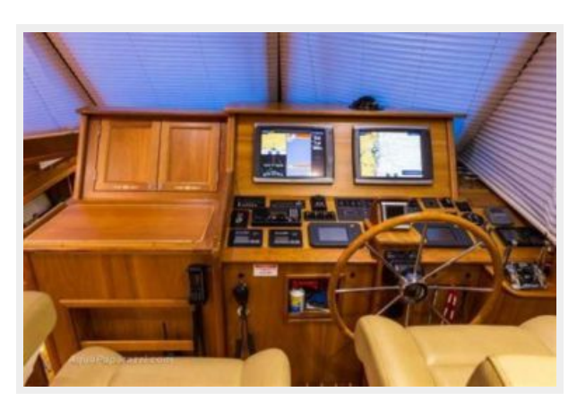
52 Sabre Helm Station