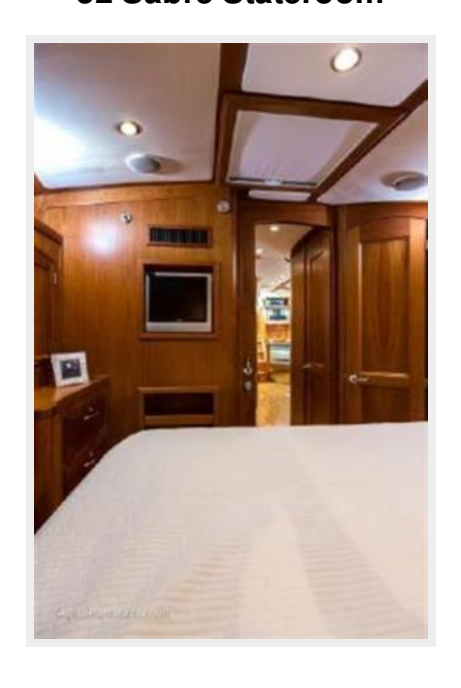
52 Sabre Stateroom