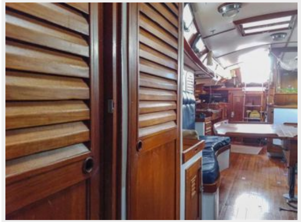
021 44&apos 1979 Cheoy Lee Aft Cockpit Looking Aft