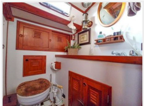
023 44&apos 1979 Cheoy Lee Aft Cockpit Head