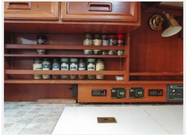
015 44' 1979 Cheoy Lee Aft Cockpit Spice Rack