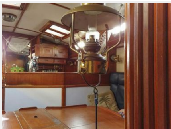
022 44&apos 1979 Cheoy Lee Aft Cockpit Salon