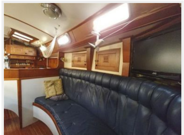
017 44' 1979 Cheoy Lee Aft Cockpit Starboard Sette