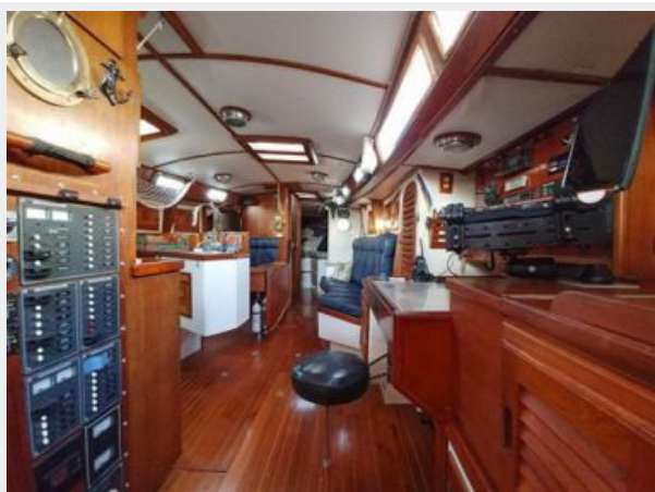
010 44&apos 1979 Cheoy Lee Aft Cockpit Main Cabin