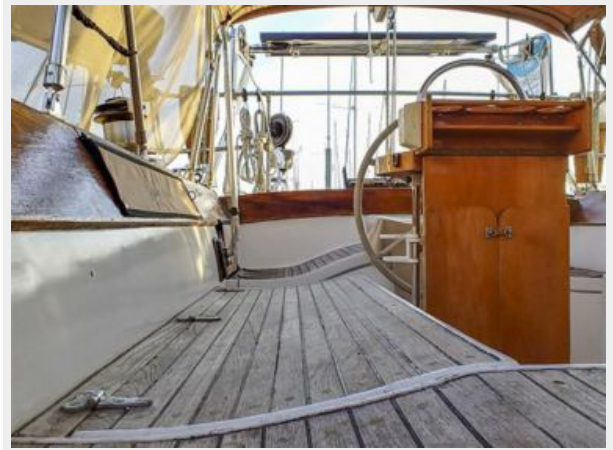
009 44&apos 1979 Cheoy Lee Aft Cockpit Starboard Cockpit