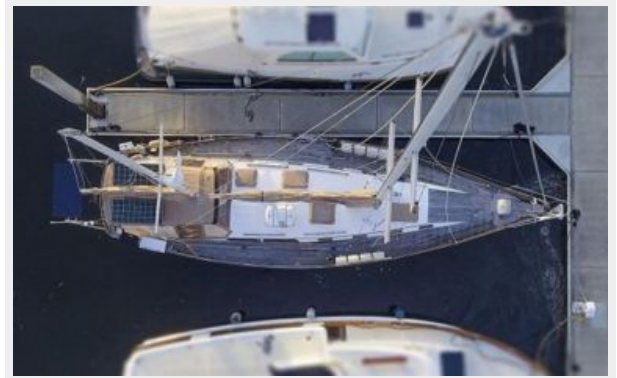
005 44' 1979 Cheoy Lee Aft Cockpit Above