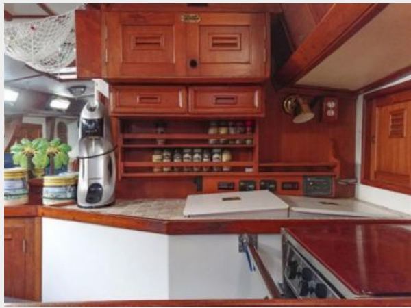
014 44' 1979 Cheoy Lee Aft Cockpit Galley