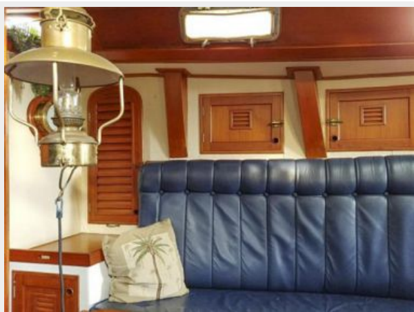
016 44' 1979 Cheoy Lee Aft Cockpit Starboard Sette