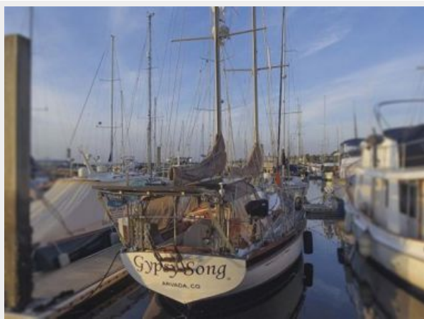
006 44' 1979 Cheoy Lee Aft Cockpit Aft View