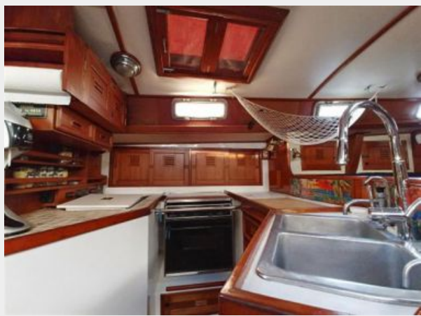
012 44&apos 1979 Cheoy Lee Aft Cockpit