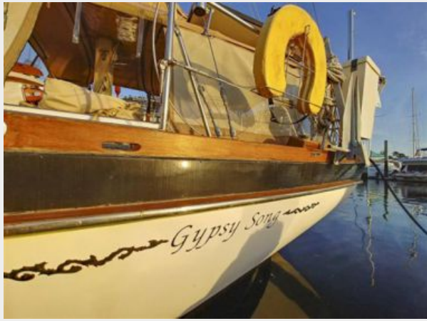
004 44' 1979 Cheoy Lee Aft Cockpit Aft Port