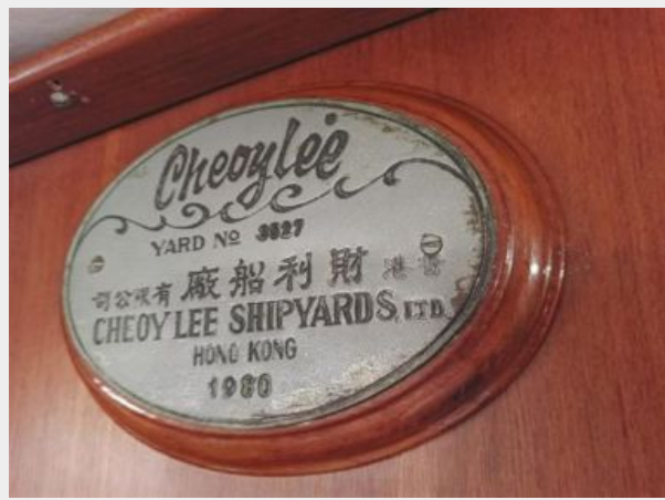
030 44's 1979 Cheoy Lee Aft Cockpit Manufacturer Plate