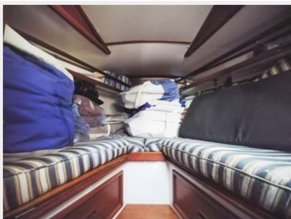
024 44&apos 1979 Cheoy Lee Aft Cockpit V Berth