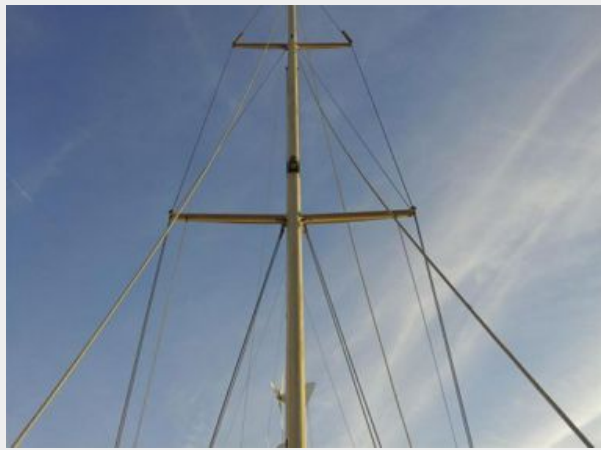
008 44&apos 1979 Cheoy Lee Aft Cockpit Mast