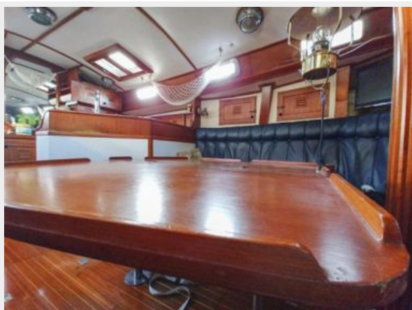
018 44' 1979 Cheoy Lee Aft Cockpit Folding Table