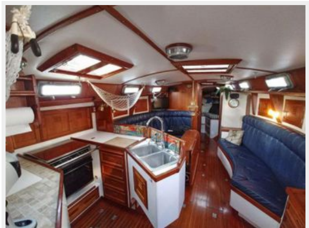
011 44&apos 1979 Cheoy Lee Aft Cockpit Galley