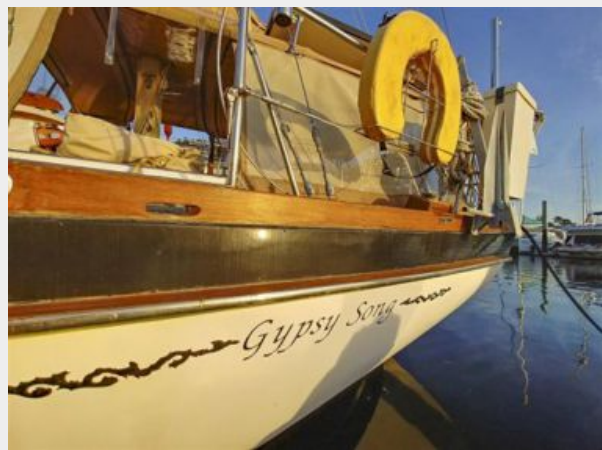
004 44' 1979 Cheoy Lee Aft Cockpit Aft Port