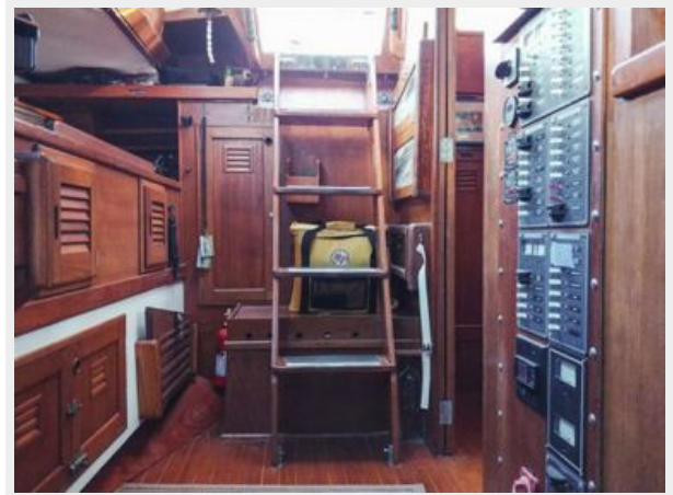
027 44&apos 1979 Cheoy Lee Aft Cockpit Companion Way