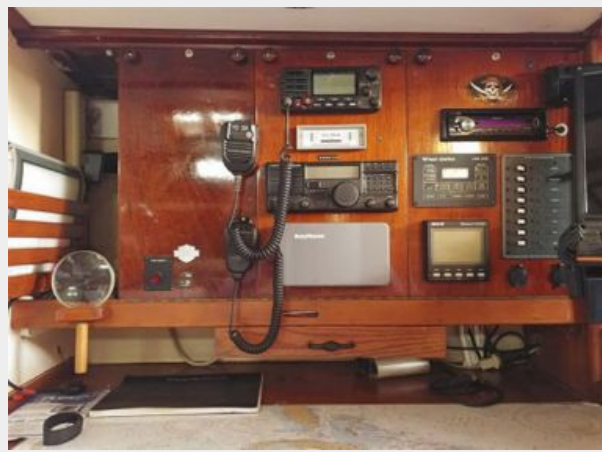
026 44&apos 1979 Cheoy Lee Aft Cockpit Nav Station