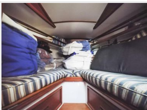
024 44&apos 1979 Cheoy Lee Aft Cockpit V Berth