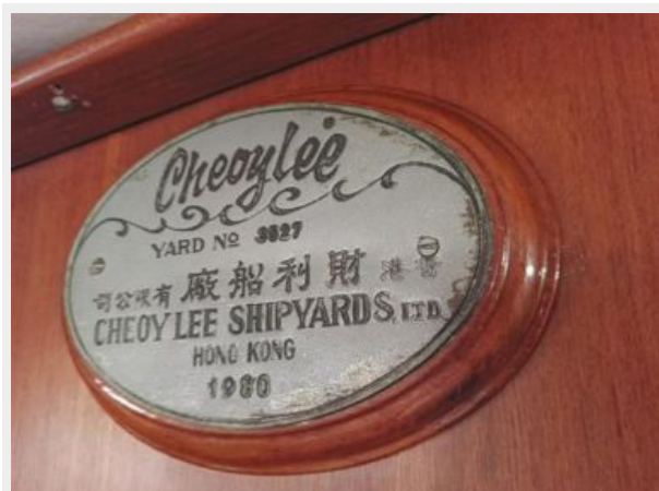
030 44's 1979 Cheoy Lee Aft Cockpit Manufacturer Plate