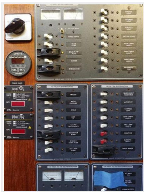
028 44&apos 1979 Cheoy Lee Aft Cockpit Power Panel