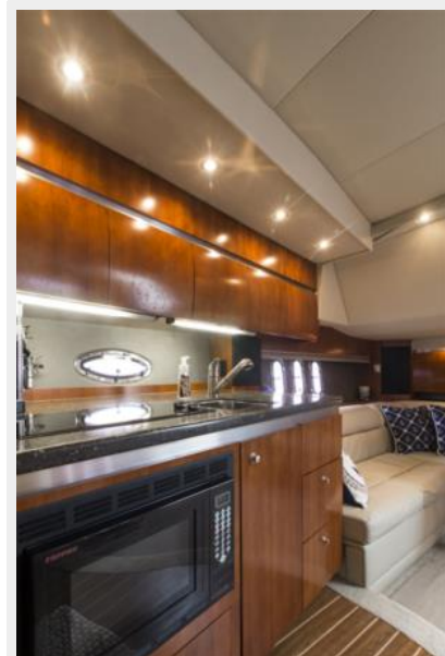
Galley looking aft