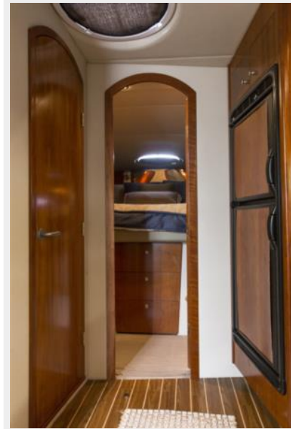
Entrance to the master stateroom