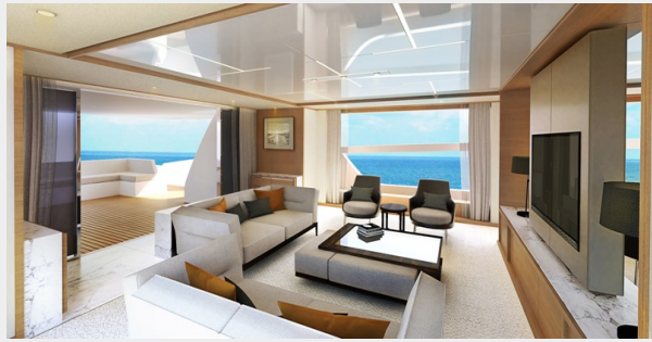
Salon and Dining - Interior by DESIGN UNLIMITED