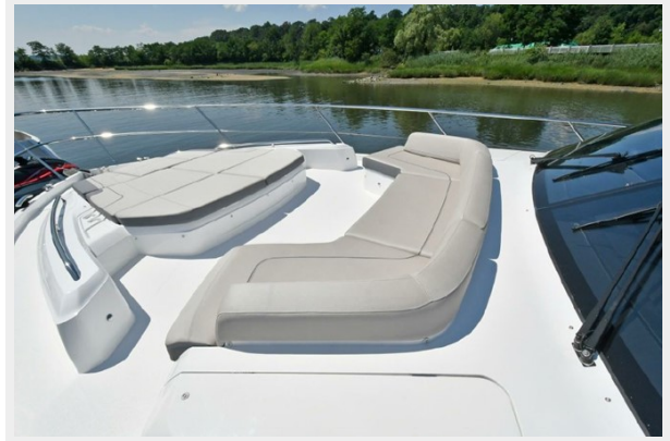
Portuguese Bow Seating with Sunlounge