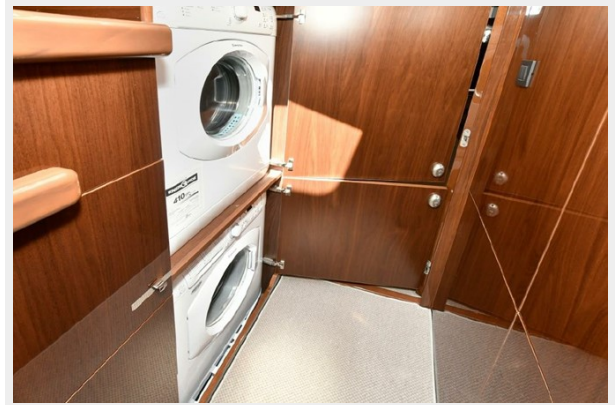
Washer/ Dryer Unit