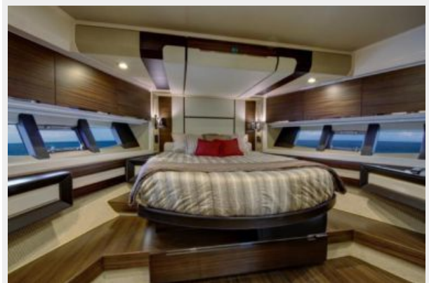
VIP Stateroom (Bow)