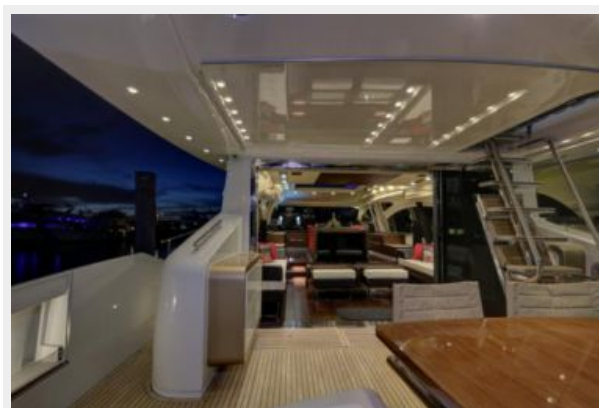
Cabin/Salon Bow Facing