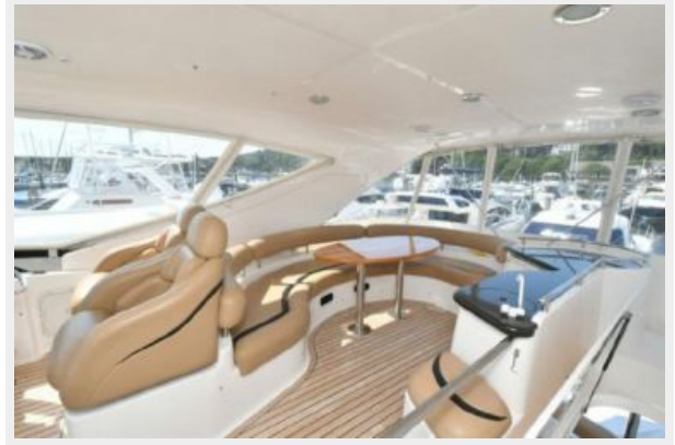
Flybridge Dinette with U-Shaped Seating