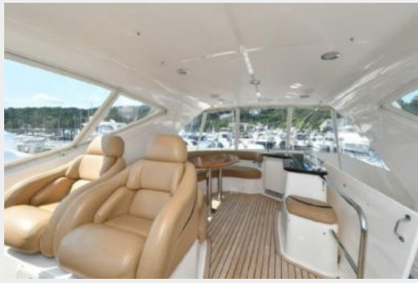
Aft Flybridge View