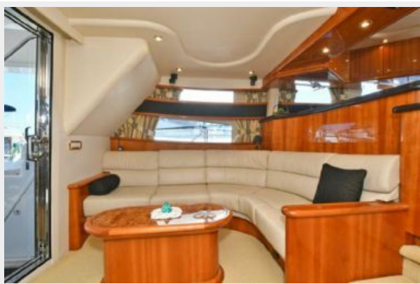
Salon Port Side