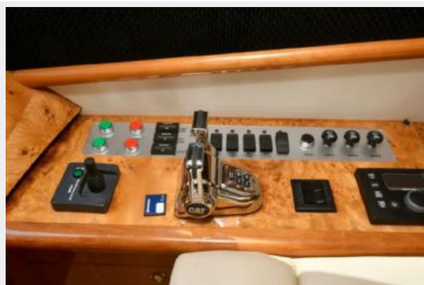
Lower Helm Station