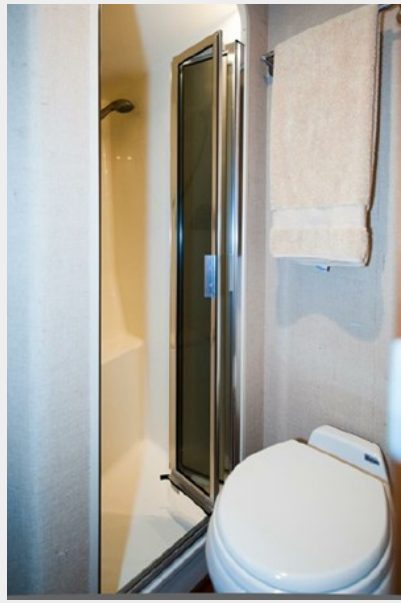
Master Stall Shower