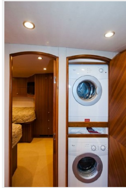
Washer/ Dryer Unit - Companionway